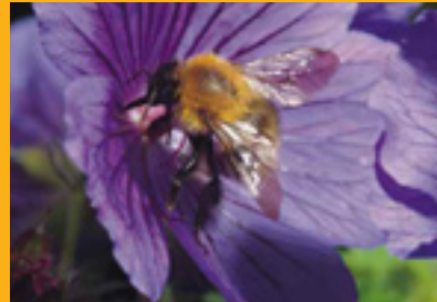
Bombus pascuorum (female)

Aquilegia Campanula Comfrey Everlasting Pea Geranium Foxglove Honeysuckle Monkshood Rhododendron Stachys Thyme