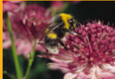
Bombus lucorum (male)

Cornflower Delphinium Fuchsia Lavender Rock-rose Scabious Sea Holly Heathers