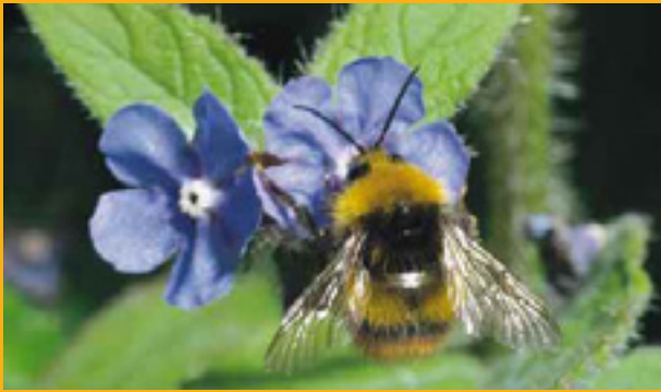
Bombus pratorum (male)