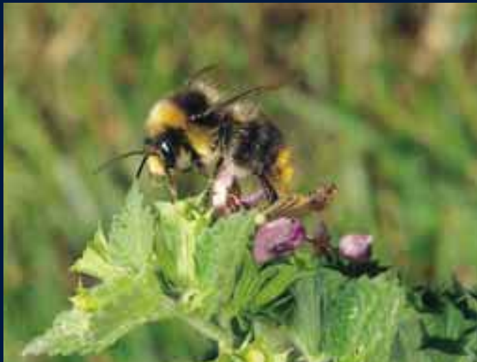
Bombus lapidarius (male)

Nest boxes for bumblebees are also available commercially but their success is very variable.