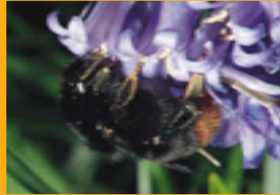
Bombus lapidarius (female)

Berberis Bluebell Bugle Flowering Currant Lungwort Pussy Willow Rhododendron Rosemary Dead-nettle Heathers