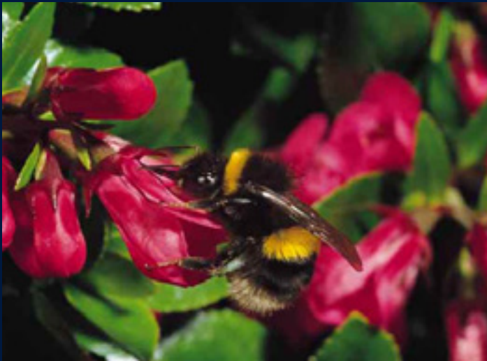
Bombus terrestris (female)