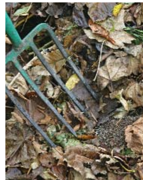
Gardeners with weapons: another danger to hedgehogs. Dave and Brian Bevan

Hedgehogs can move quite quickly, at up to 40 metres a minute (just under two miles per hour) when the need arises, making use of their surprisingly long legs. This is not fast enough, however, to allow them to escape from their major predators, foxes and badgers. Foxes mainly kill young hedgehogs in their nests whereas badgers take adults. This may be upsetting but it is, after all, part of the natural cycle and there is no real reason to interfere with it. You can, however, provide hedgehogs with fox- and badger-proof nesting sites made