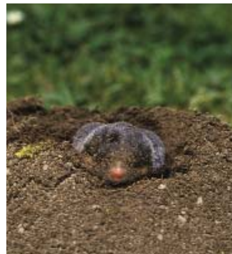
Moles use their hugely powerful front legs like shovels. Dave and Brian Bevan

when it is damp and easy to dig. Why not use the soil for potting plants? Leaving moles undisturbed means that they are less likely to dig new tunnels. Moles can actually benefit the garden by eating harmful insect larvae like leatherjackets and helping to drain and aerate heavy soils.