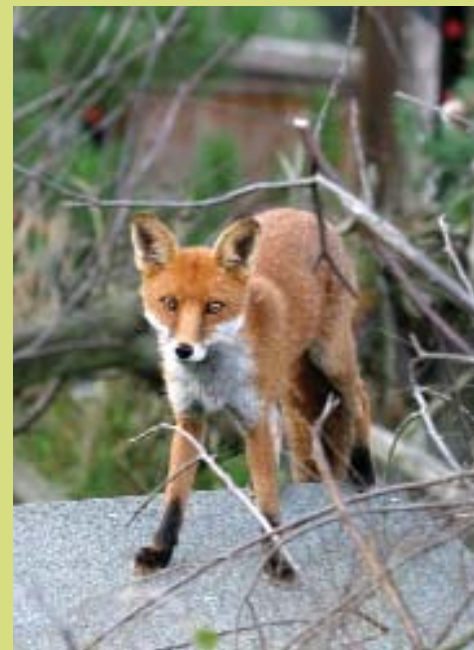
Fox on hen house in search of an easy meal. Dave and Brian Bevan

Evidence of the presence of badgers includes small pits called 'snuffle holes' produced when they dig for earthworms and other invertebrates. Occasionally, they may dig a small sett under your shed. Badgers are less active in winter but, unlike some mammals, do not hibernate. Cubs are usually born in late January or February but stay underground for about two months.