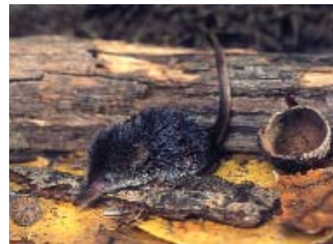
The pygmy shrew is only about 6 cm long and weighs less than 4 g.

Of the mammals likely to visit gardens, badgers, the hazel dormouse and all species of bat have full legal protection. This means they may not be caught, disturbed or killed without a licence and that their roosting and breeding places may not be interfered with. The burrows of water voles are also fully protected, as are the animals themselves when they are inside them. Contact Natural England for more details (see Contacts, page 29).