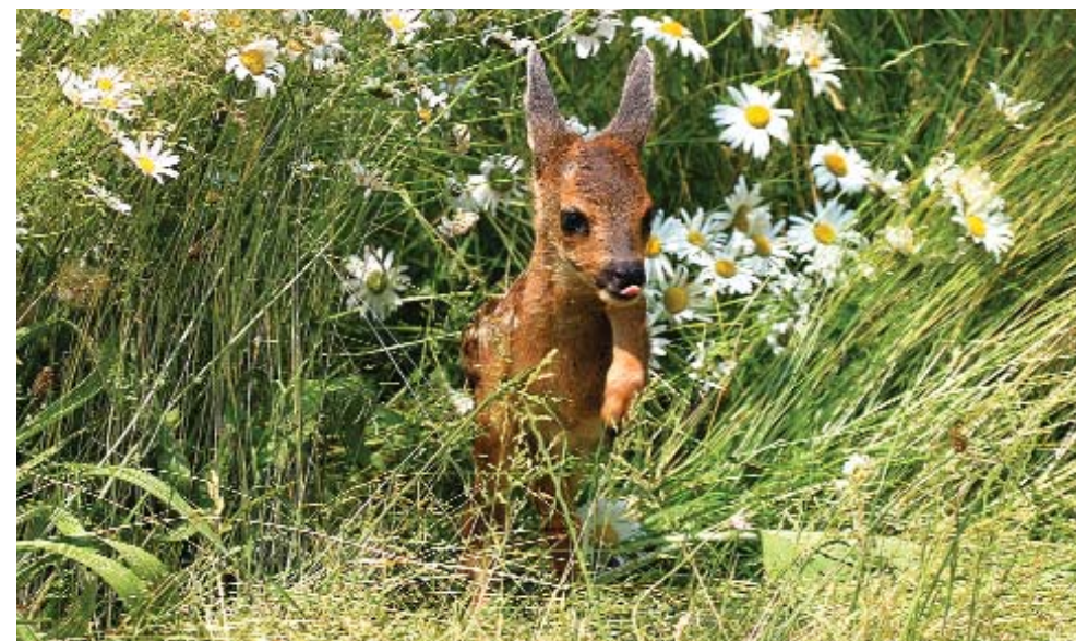
Young roe deer.