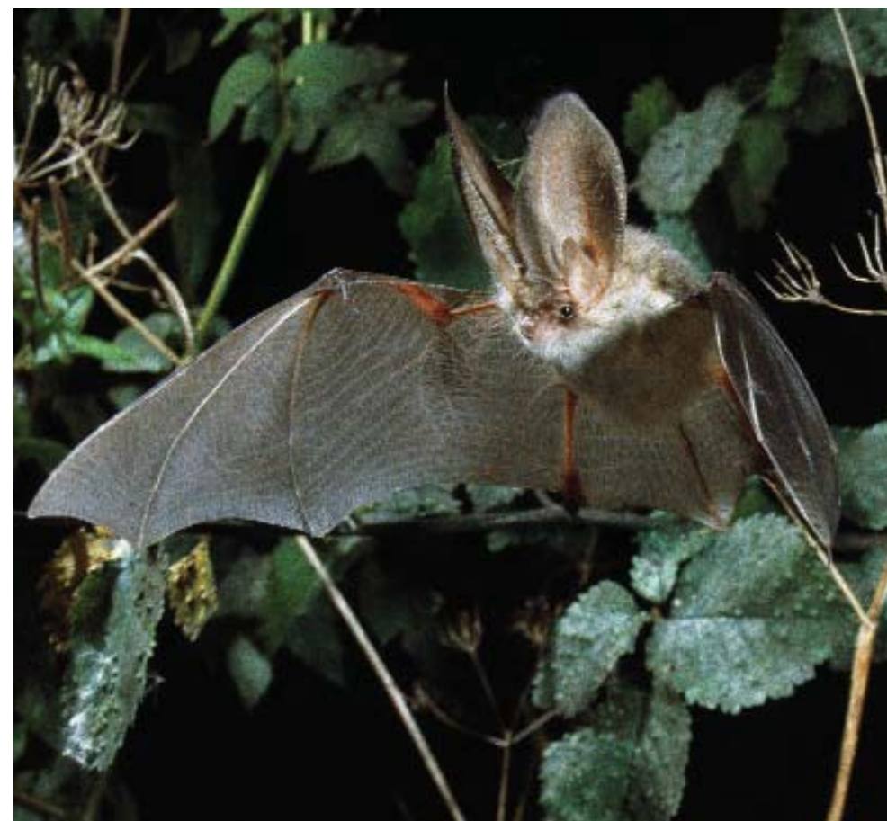
The brown long-eared is one of the most widely distributed species of bat in Britain.

Mammals come to your garden throughout the year. Although many British mammals are far less active in winter, only hazel dormice, bats and hedgehogs can be said to hibernate. However, bats may wake in very warm