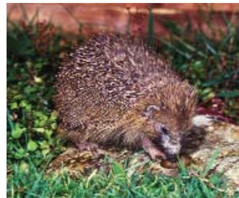
Hedgehogs may be adversely affected by slug pellets. Dave and Brian Bevan

Chemicals can help control unwanted plant growth and garden pests. However, almost all poisons will kill far more than their target species and may remain toxic in the soil for long periods. Hedgehogs eat large numbers of invertebrates every night, including slugs that may have fed on slug pellets. It is believed that the poisons from these pellets may accumulate in hedgehogs and harm them. In the same