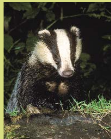
Badgers are present in every English county and are found in the parks of outer London.

Foxes are now a common sight in many gardens, perhaps more so in urban areas. They are highly intelligent and extraordinarily adaptable animals, eating whatever is available, animal or vegetable. Whereas badgers are very rarely seen before dusk, foxes are bold enough to turn up at any time, although they are generally nocturnal. Cubs are born in March and remain in the den (called an 'earth') for almost a month before emerging for exercise and play.