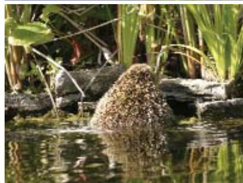
Hedgehogs are good swimmers and can easily get out of ponds if the edges are shallow. Dave and Brian Bevan