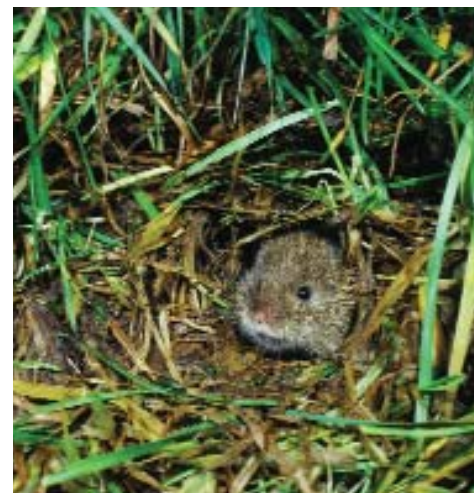
Short-tailed field vole at entrance hole to nest. Dave and Brian Bevan

The small mammals that you are most likely to find in your garden fall into three broad categories: shrews, voles and mice. Shrews are classified as insectivores (together with hedgehogs and moles) while voles and mice are rodents.