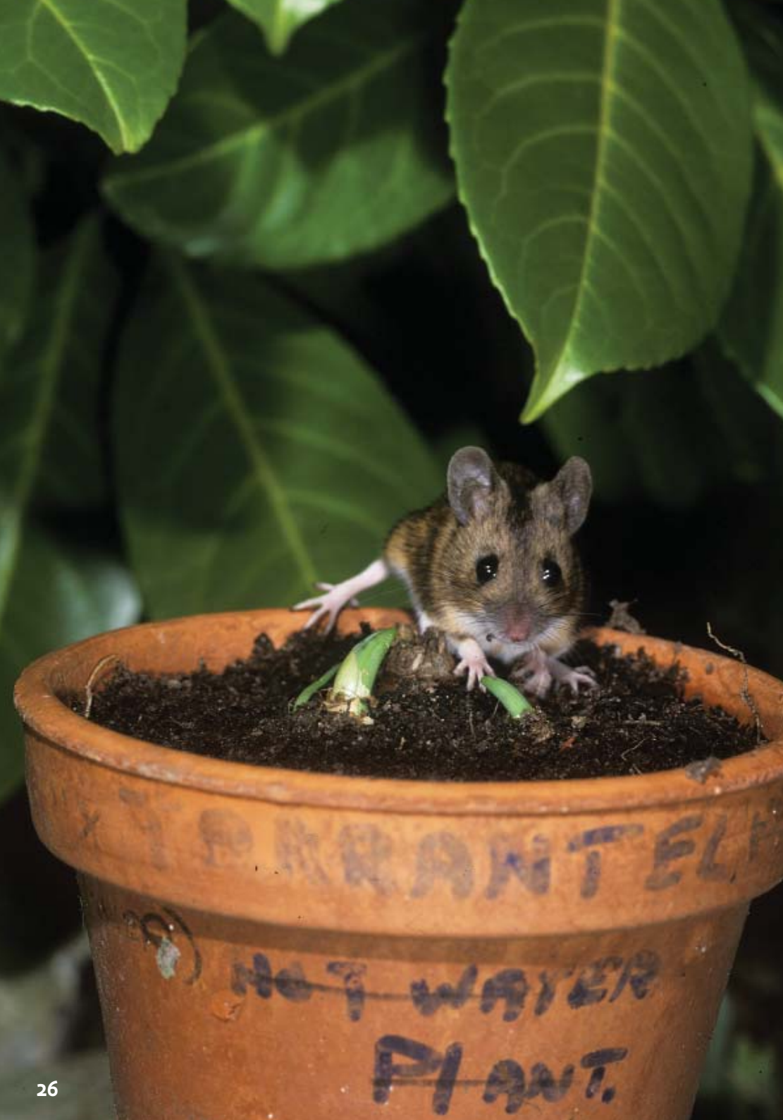
Wood mice are amongst several garden mammals with a taste for bulbs. Dave and Brian Bevan

spells and with increasingly mild winters, hedgehogs are now seen foraging later and later in the year. No hibernating animal should be disturbed – the process consumes the reserves of energy it needs to see it through the cold weather.