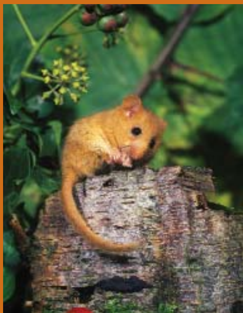
Hazel dormice may take advantage of bird baths and feeders.

A furry tail and golden coat distinguish the tiny hazel dormouse from true mice. More like a small squirrel than a mouse, the dormouse has large ears and prominent eyes. These attractive