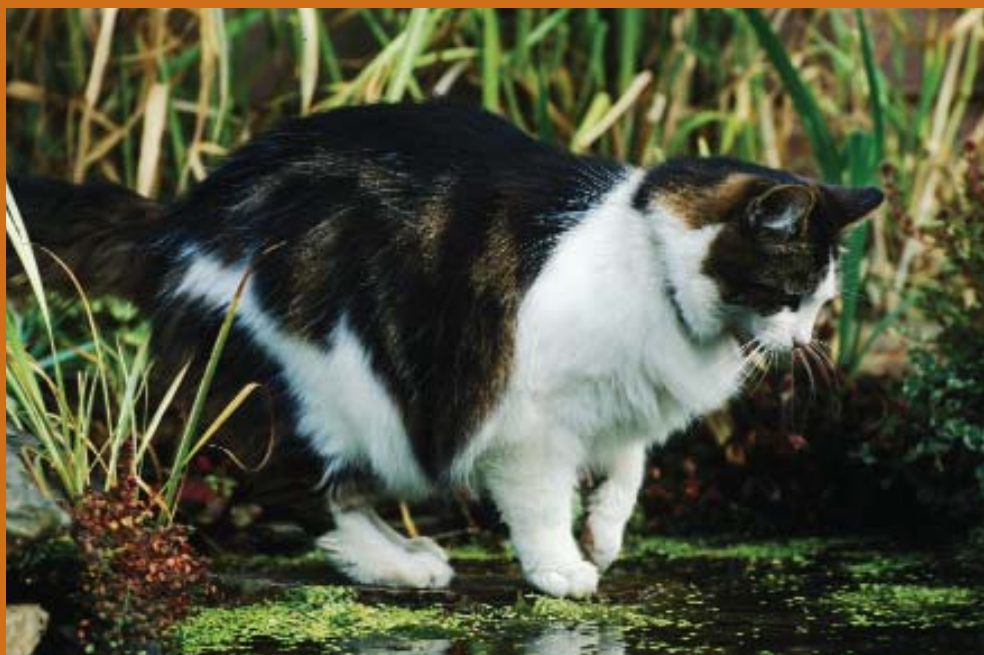
The domestic cat is the most dangerous garden predator of all. Dave and Brian Bevan

corrugated iron or a large board placed on the ground in an undisturbed corner will often attract small mammals to nest underneath, safe from most predators. It can be easily covered with vegetation to avoid creating an unsightly feature: its effectiveness will be unaffected by whatever is placed over it.