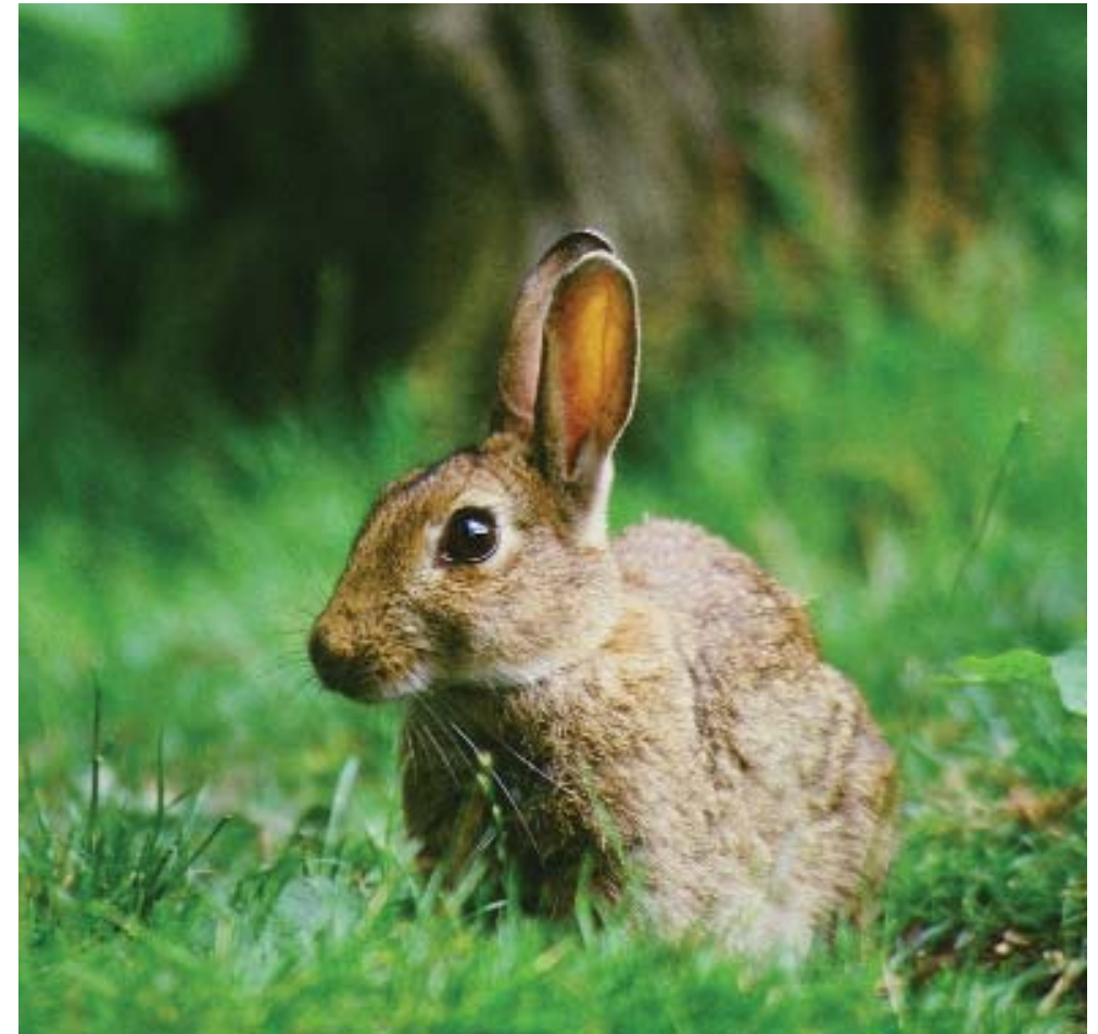
Rabbits will eat almost any garden plant. Stephen Oliver

mammal species. There is not always a simple answer but you can alleviate some problems. Some concerns spring from a desire to protect vulnerable animals from predation. While this is understandable, it has to be recognised that the mammals in your garden – cats aside! – are wild and that interfering with the natural cycle in which some kill while others are killed is generally not helpful.