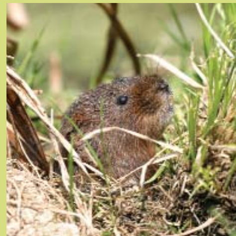
The rare water vole.

You can catch mice in a humane trap – these are available from many pet shops – but ensure you check it regularly. Release captured animals a couple of kilometres away or they will return. However, mice 'dumped' in the countryside like this will probably die fairly quickly so it may be kinder to use an old-fashioned snap trap. An alternative is an ultrasonic deterrent to keep mice out of the house altogether. However, these devices are rather expensive and their efficiency is not fully proven.