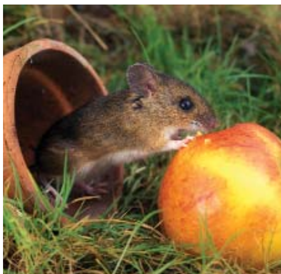
Dave and Brian Bevan

butterflies. In spring, many mammal species feast on buds and fruit blossoms while in autumn, they gorge themselves on ripe berries and fruit before the hardships of winter. For very small mammals, even brief food shortages in periods of cold weather can be fatal. You should aim to have garden fruiting at different times to help ensure that food is constantly available. In addition, flowering plants such as honeysuckle – and especially night-scented blooms such as stocks, evening primrose and nicotiana (tobacco plant) – will attract insects, so providing food for bats.