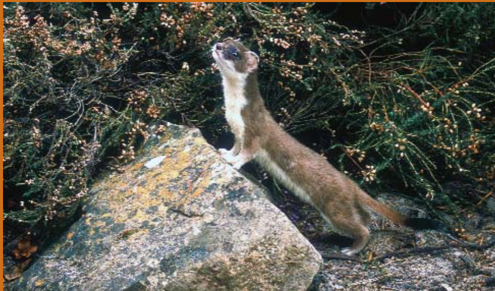
Stoats are generally longer than weasels and may be twice their weight.

up residence and even breed there, leaving behind long, curly droppings full of their victims' fur or feathers.