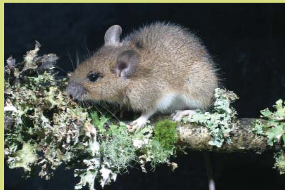
The yellow-necked mouse closely resembles the wood mouse but is larger. Dave and Brian Bevan

True mice, either brown (such as wood mice and yellow-necked mice) or grey (the house mouse), have pointed noses, long hairless tails and large ears and eyes.