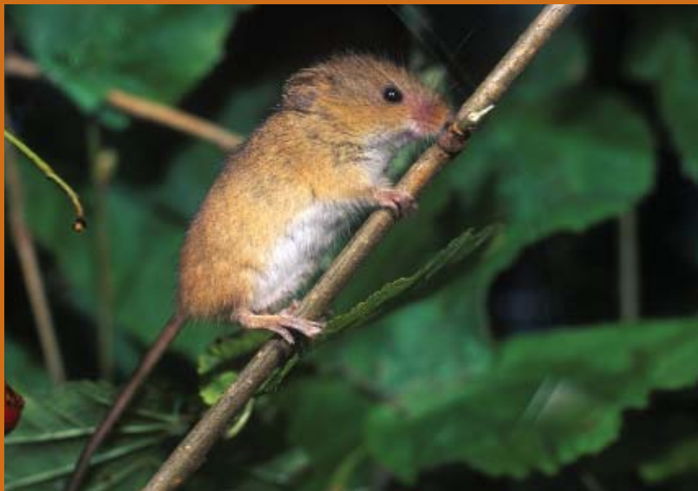
The harvest mouse was first described by the famous eighteenth century naturalist, Gilbert White. Dave and Brian Bevan

More rarely seen is the tiny, red-brown harvest mouse which occasionally turns up in rural gardens. Its tail is its most distinctive feature as it can be used as a fifth limb to hold on to grass or small twigs. As is the case with some monkeys, this prehensile tail enables harvest mice to move rapidly through vegetation. Harvest mice make round nests suspended in clumps of grass at about knee height.