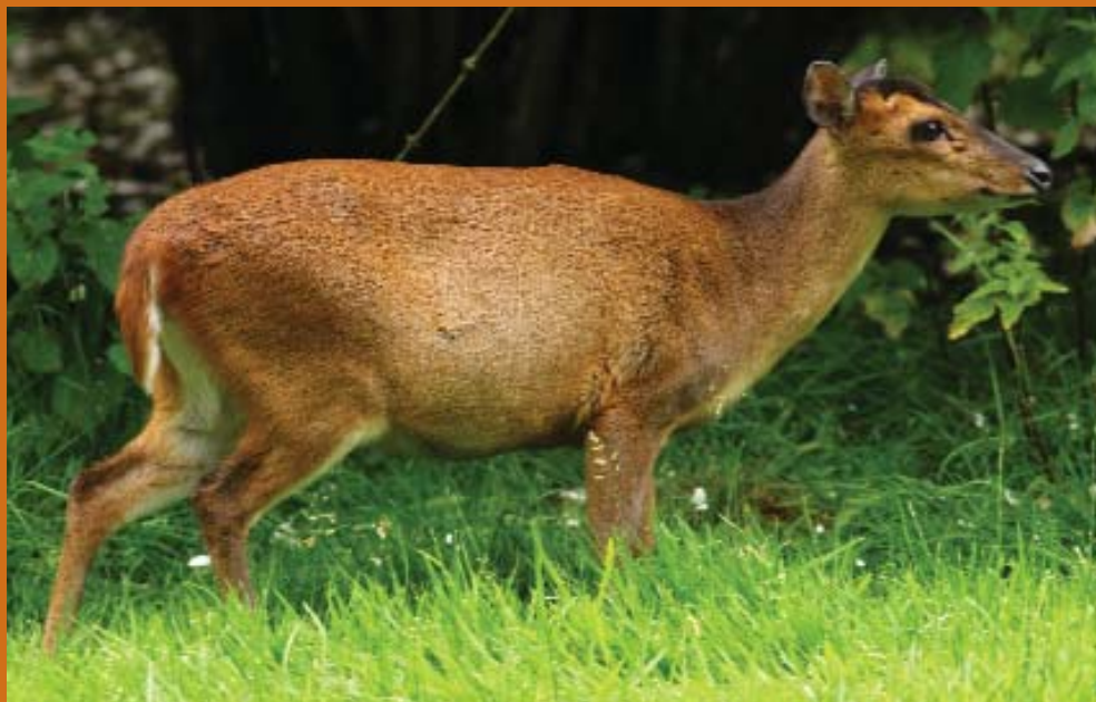
The introduced muntjac is now common in much of southern England. Dave and Brian Bevan

distinctive droppings, which often look like little fat wine bottles with a dimple at one end and a point at the other. Their footprints, called slots, resemble those of sheep but are more pointed.