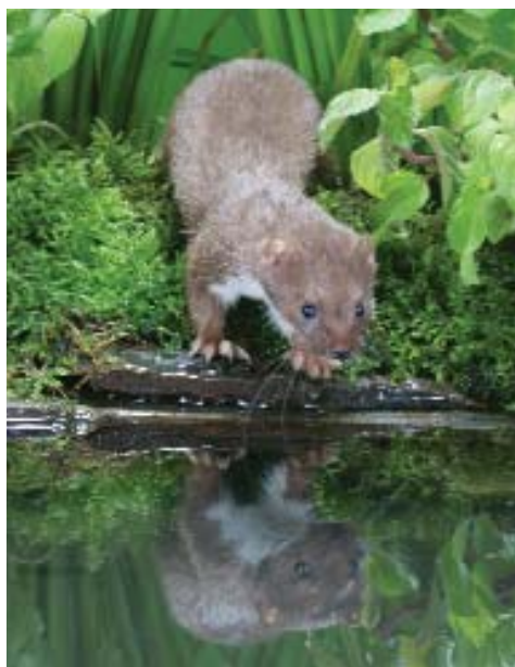
Reflecting weasel! Dave and Brian Bevan

pond. This protection will enable mammals to reach your pond without having to cross wide open expanses of mown lawn, where they are most vulnerable to predators such as cats.