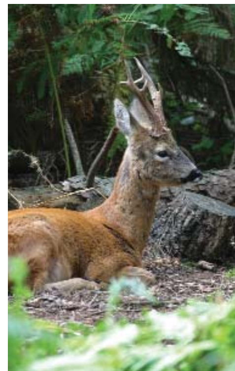
Roe buck at rest.

The roe deer is one of our two native deer species, the other being the much larger red deer. Roe deer are a bright, foxy red in summer and dull grey in winter. Males have short, gnarled, spiky antlers. You might also see their