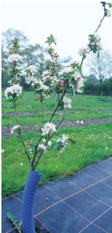
Guards for fruit trees are one way of protecting them from rabbits. Dave and Brian Bevan

Deer are very hard animals to exclude – and rabbits even more so. The only certain method is secure perimeter fencing and this comes with a high price tag! Enclosing especially vulnerable garden areas such as vegetable plots may be more realistic,