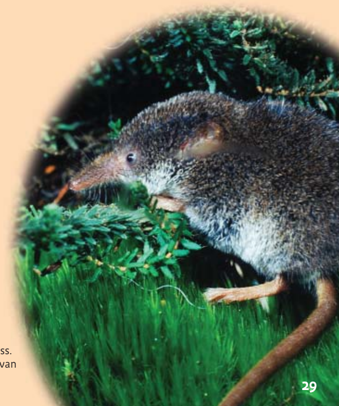
Pygmy shrew on moss. Dave and Brian Bevan

This is one of a range of wildlife gardening booklets published by Natural England. For more details, contact the Natural England Enquiry Service on 0845 600 3078 or e-mail enquiries@naturalengland.org.uk