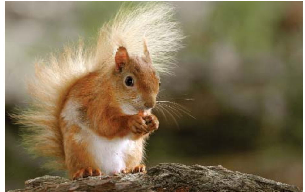
The red squirrel is now a great rarity in England.