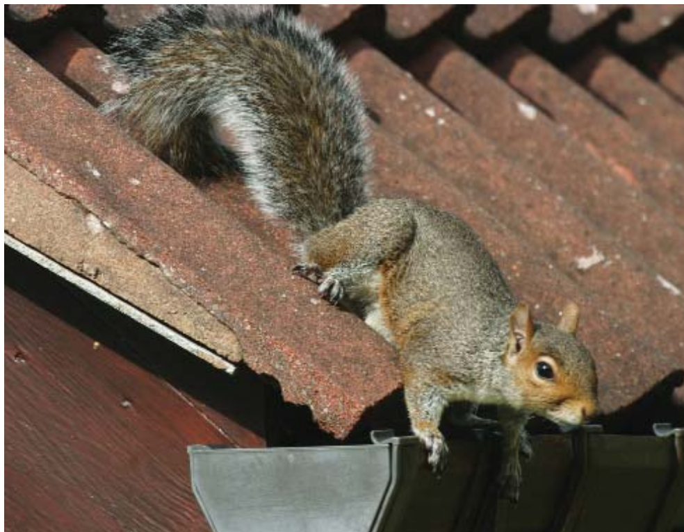
The agility of grey squirrels means they can get virtually anywhere. Dave and Brian Bevan

with balls of chicken wire. Wait until all the squirrels have gone out and stuff wire balls tightly into the holes. Ensure that all the squirrels have left and that there are no nests containing young in the roof-space. You will not want to shut their mother out and trap them inside to starve. If there are young, wait until they are old enough to go out with their mother before sealing the entrances. Grey squirrels have two litters a year, which means they will have dependent young for much of the spring and summer.