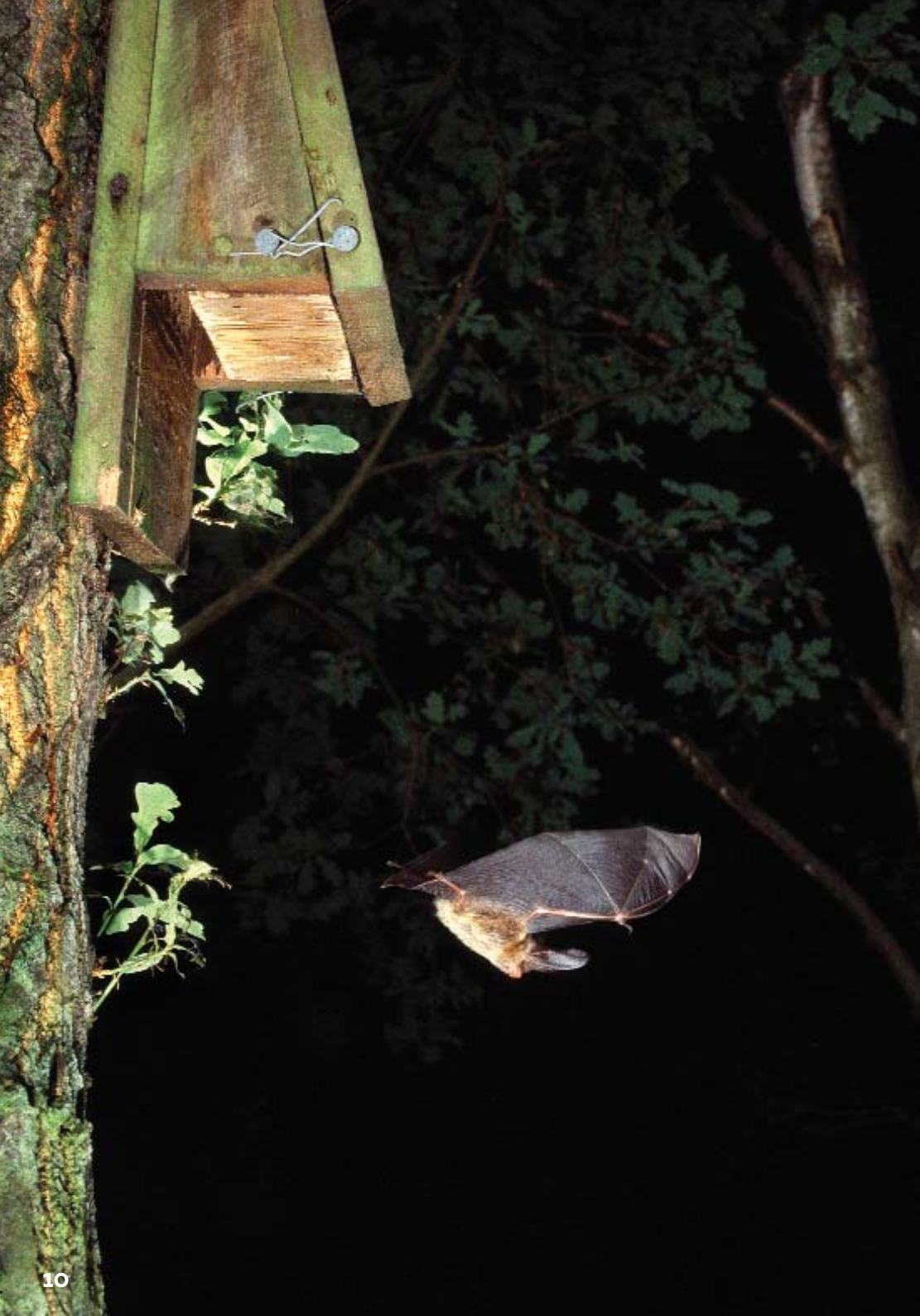
Ready-made bat boxes may encourage brown long-eared bats to your garden. Frank Greenaway

office for advice (see Contacts, page 29). For more information, refer to the Natural England booklet, Focus on bats .