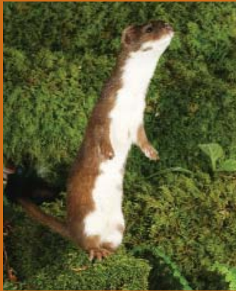
This is a characteristic stance of the weasel, probably enabling it to put its acute sense of smell to best use. Dave and Brian Bevan

Both stoats and weasels are small, long and lithe. Each species has a ginger-brown coat and a cream or white belly. The larger stoat, which takes many rabbits – especially young ones – has a very distinctive black tail tip. Both species climb well and stoats sometimes scale creeping plants like ivy to raid birds' nests in the roof spaces of houses. They may then take