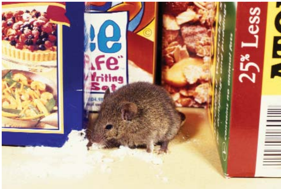
The house mouse is quick to track down any food spillages! Dave and Brian Bevan

The tiny animals with long pointed noses often left dead by cats are shrews. These eat invertebrates such as worms, snails, woodlice and spiders. Shrews taste unpleasant to many predators and often remain uneaten – although owls are undeterred!