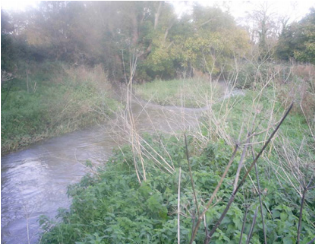
Fig 4.46: A vegetated mid channel bar, surrounded by a well-buffered riparian zone. In general there is sufficient protection afforded the river from landuse practices and every effort should be made to protect this and encourage the local landowners to maintain the buffer. Salmonid spawning and nursery areas are present throughout the Reach and it is feasible that a reasonable proportion of seatrout that spawn in the Delvin River would do so in this section.

The final Reach in the Delvin River has a good diversity of instream and riparian habitats. There are no major concerns identified within this reach in respect of morphological and hydrological factors. The river channel has been reinforced and possibly resectioned in some areas but not sufficiently as to negatively impact on the ecology of the river. There were no signs of serious bank erosion due in part to an established buffer zone between the river and major landuse. This Reach would have the majority of angling pressure and there is evidence of bank and instream clearance by anglers for fishing. The Gormanston and District anglers have also periodically stocked the river with brown trout.