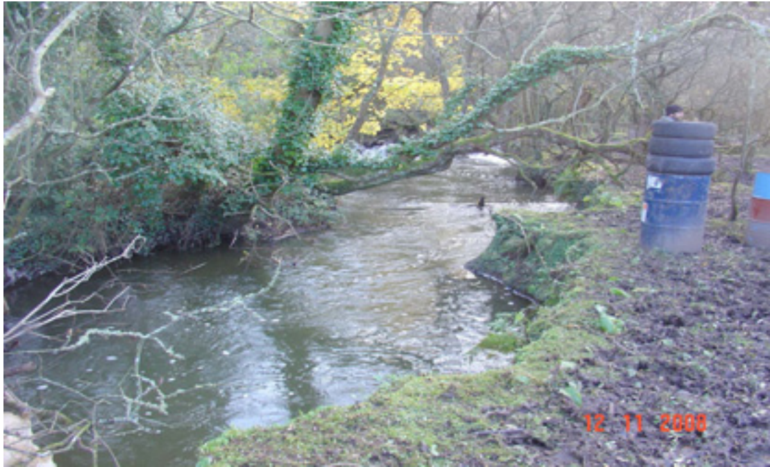
Fig 4.28: This area just upstream of Stamullin is used in a recreational capacity for paintball games. The riverine habitat is relatively diverse in this section though does suffer from moderate/excessive shading. The combination of the shading and the active pursuits that are undertaken have impacted the riparian zone by poaching of the bank top and the loss of riparian understory vegetation on the LHB. It would be advisable to suggest that a three metre buffer zone is established to protect the banks and reduce erosion.