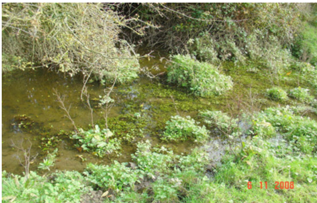
Fig 4.69: The floodplain and margins of the river has spring fed flushes and areas of wetland.