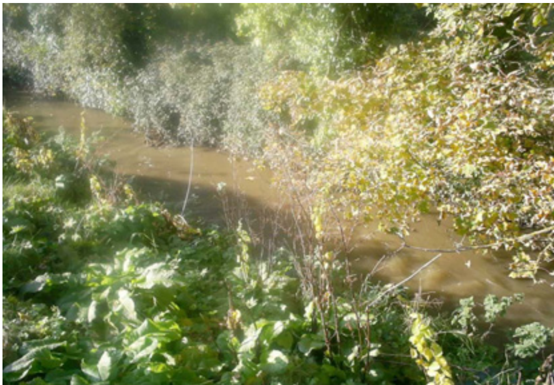
Fig 4.64: Mid section of the site, riparian vegetation is well established and banks are stable.