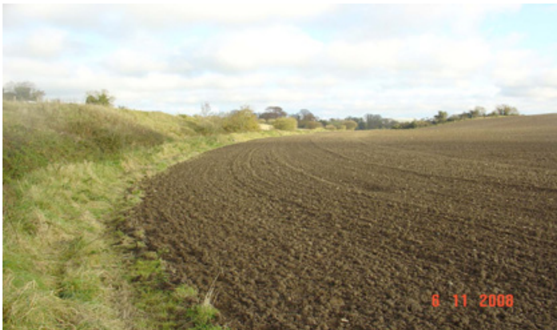
Fig 4.61: Land use is predominantly arable. The river is to the left of the picture. The river has an embankment on this field to prevent flooding