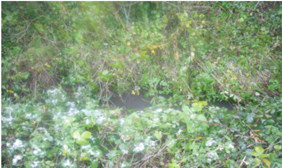
Fig 4.52: The bank face and top were quite heavily vegetated primarily with briars particularly on the left bank and there would be a risk that this area could suffer from over shading unless maintained.