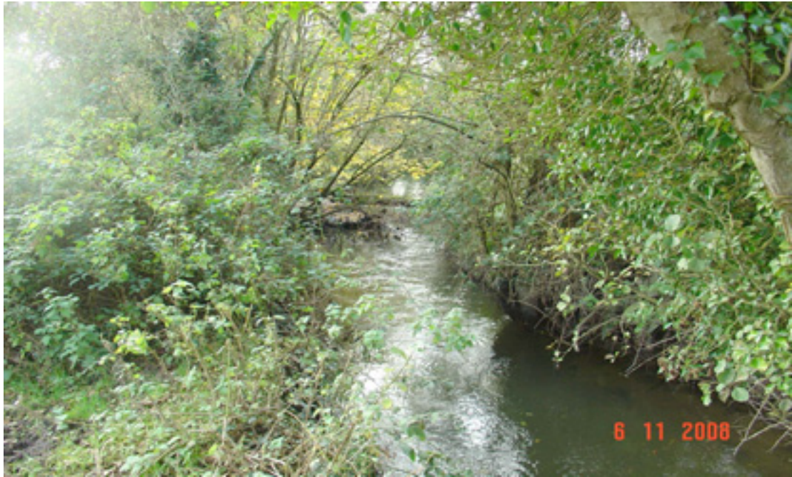
Fig 4.21: Complex riparian vegetation is present throughout most of the area.