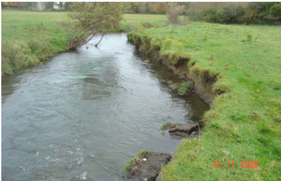
Fig 4.31: Large chunks of freshly eroded bank were evident throughout the upper section of Reach 7. There will be knock-on effects downstream as silt is released into suspension but more importantly the changes in the stream morphology and subsequent changes in flow dynamics may induce further erosion problems downstream. Currently, the stability of sections of the bank further downstream in Gormanston Demesne could be described as fragile due to present bankside maintenance practices and every effort should be made to stabilise and establish vegetation in this section.