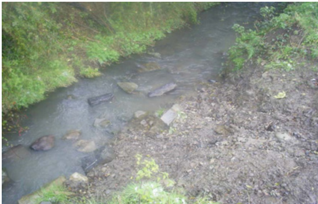
Fig 4.50: The channel is embanked to an average height of 1.75m and has been straightened, there is evidence of poaching in this section.

There were no invasive/alien species found on this site