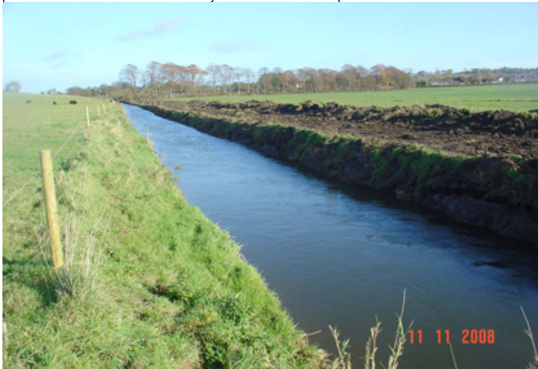
Fig 4.85: Recent drainage maintenance work undertaken upstream from Naul at Bodingtown.

The Delvin River upstream of Naul has been subjected to intense manipulation since the end of the 19 th Century and this will have had a serious impact on indigenous fish populations and all aquatic flora and fauna. Subsequent maintenance and extensive arterial drainage have compounded the impact on the river and in conjunction with agricultural point and non-point pollution it is evident that the diversity and numbers of fish present are minimal.