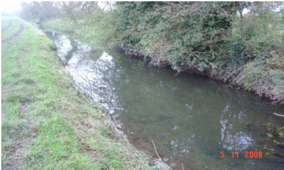
Fig 4.53: The river has been resectioned and dredged and this canalised section is completely straight from top to bottom. This survey site is indicative of circa 8km of the Delvin River at the upper end of the catchment.

There were no invasive/alien species found on this site.