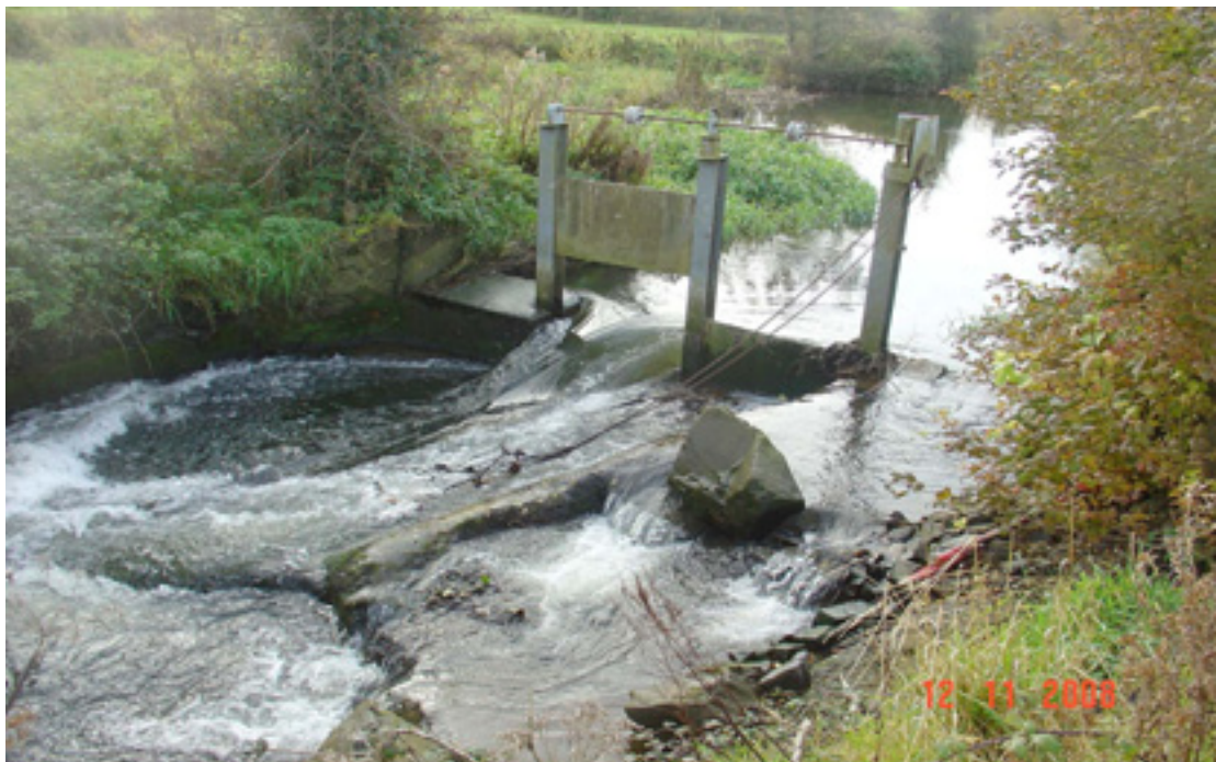
Fig 4.25: This hybridised weir/sluice system is maintaining water depth in the wetland area described in fig . The only modification that may be undertaken would be to enhance fish passage facilities.