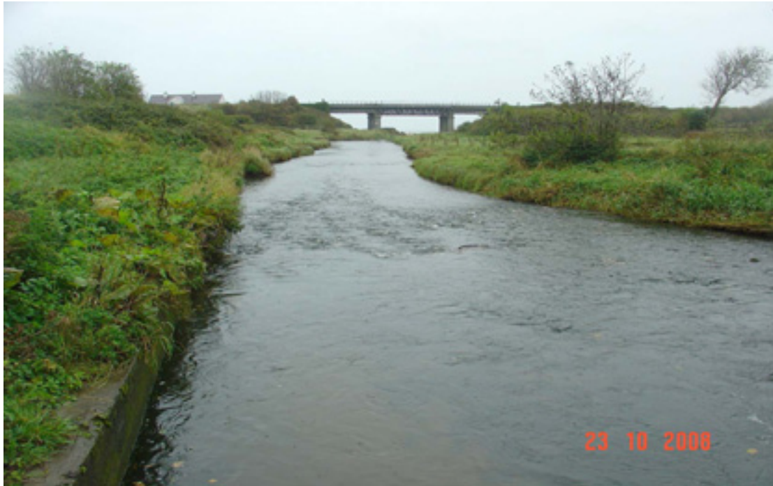
Fig 4.49: The final run of the Delvin River below the weir is tidal. This is the primary area for sea trout fishing in the river and large brown trout have also been caught in this area.