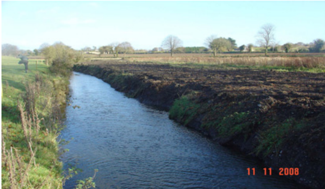
Fig 4.9: Total destruction of instream habitat and loss of all riparian vegetation from the RHB, this will result in increased sediment loading, bank erosion and long term highly negative impacts on the biodiversity of the river corridor. This style of dredging is very outdated and highly unnecessary; it would be advisable to educate landowners in environmentally sensitive methods of drainage/dredging.