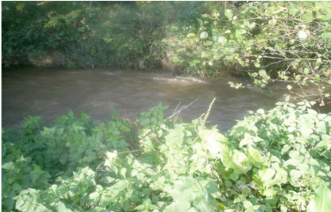
Fig 4.82: Bankside vegetation is well established and banks are stable