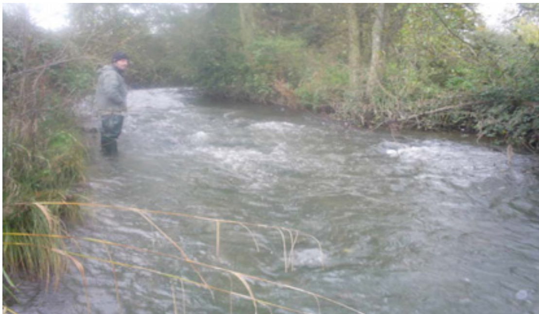
Fig 4.74: Good quality riffle-pool-glide configuration, clean gravels and a diverse instream and riparian habitat.

There were no invasive species present on the site.