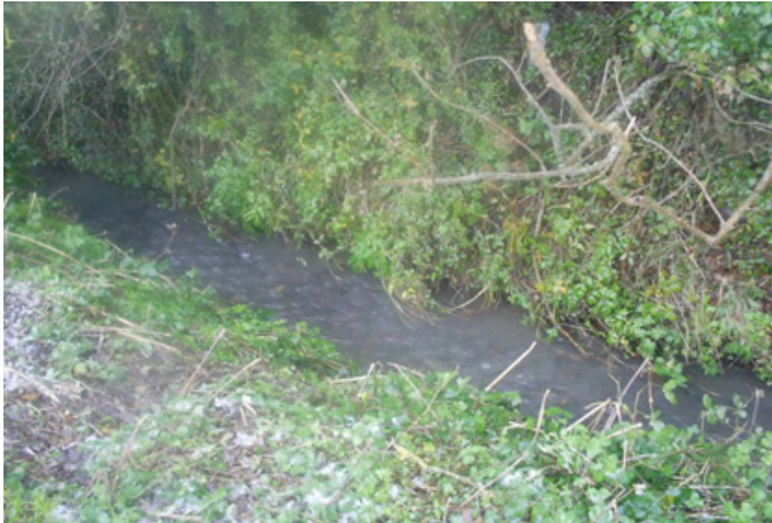
Fig 4.51: Riffles and glides were the dominant flow features. The gravel was relatively clean though that may be due in part to the extensive rainfall in the summer, this was evident in other parts of the catchment.