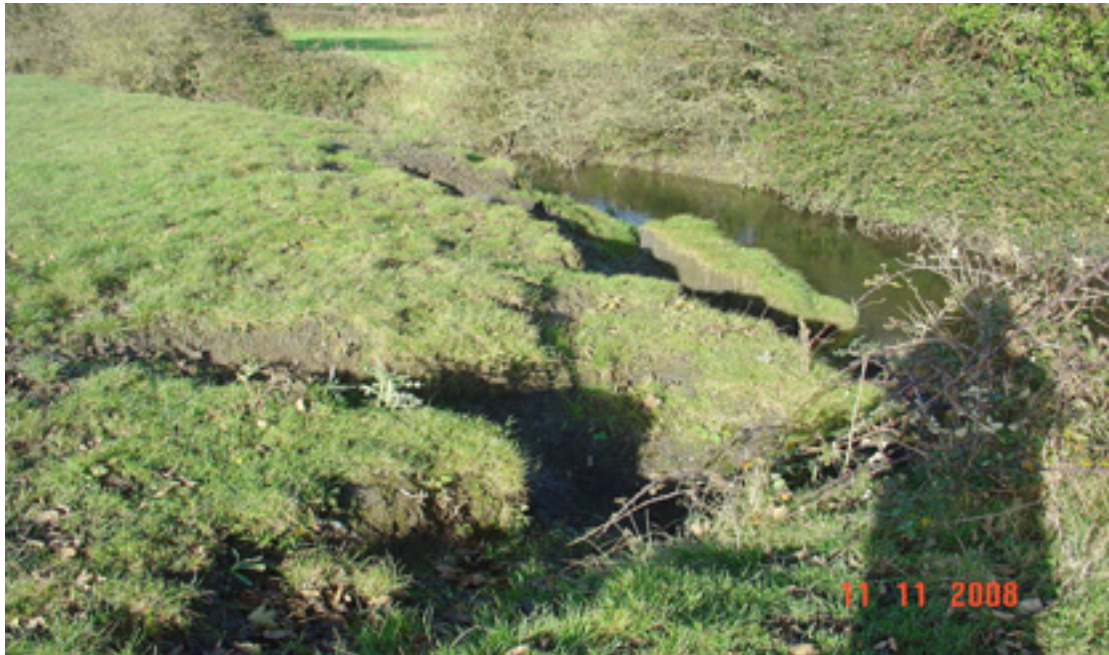
Fig 4.5: Poaching from cattle is severe in this section at the top of Reach 2 but this is an exception. Generally the river bank was fenced on the RHB and land use on the LHB was predominantly lightly grazed impoverished grassland and wetland.

every effort should be made to monitor progress and discuss maintenance issues with local landowners.