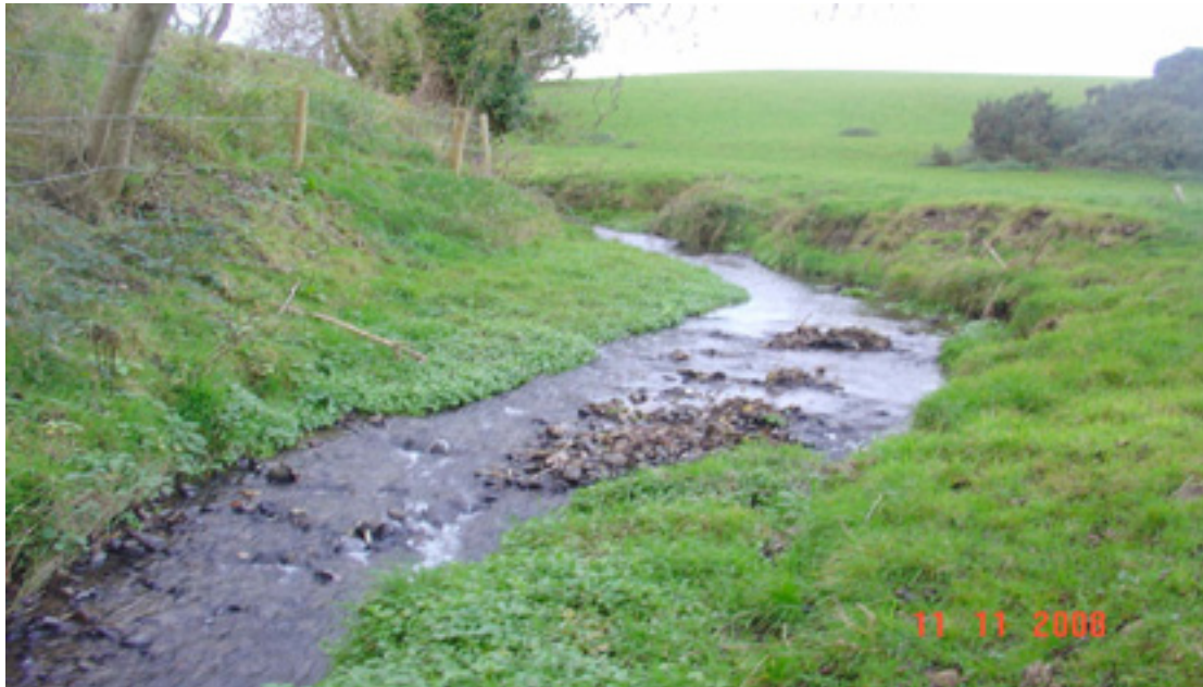
Fig 4.88: An example of good quality spawning and nursery habitat on a tributary d/s of Naul. These tributaries require protection from indiscriminate dredging and drainage

The main point of concern relative to indigenous fish communities in the Delvin River from Naul to the Estuary is water quality. The river has a good diversity of riffles, pools and glides, riparian vegetation is generally well established, banks are predominantly stable and the range of instream habitat is very good from Reynoldstown North downstream. Indigenous fish communities in the middle to lower end of the Delvin catchment should at least be well established and in reality, thriving. The main parameter that is negatively impacting the food chain from invertebrates to fish is the poor quality of the water and the main thrust of any action to assist all aquatic fauna will be the addressing of the water quality.