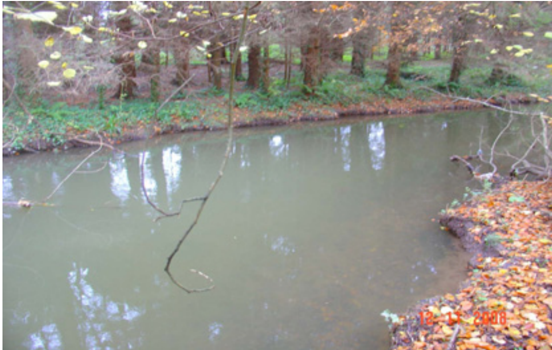
Fig 4.44: A proportion of conifers within the plantation at Gormanston College are too close to the river bank and are shading the bank top preventing the establishment of vegetation. It would improve the biodiversity of the river section if conifers within 10m of the bank-top were removed and would also assist in stabilising the banks through the establishment of riparian grasses, herbs, shrubs and trees.