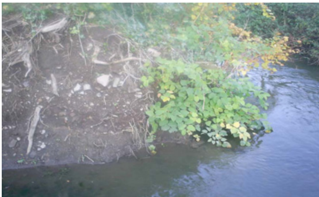
Fig 4.65: Japanese Knot Weed; this area had been recently excavated as part of a land drainage and floodplain reclamation scheme.