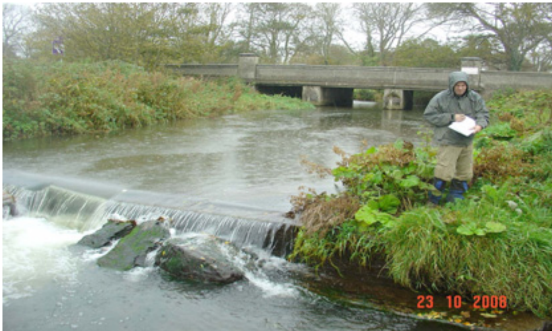
Fig: 4.48: The weir at Knocknagin Bridge denotes the HWM (tidal high water mark) on the OS maps. It is likely that aquatic species that are euryhaline (adaptable to salt and fresh water) such as Dab ( Limanda limanda ) may travel upstream beyond the HWM, though predominantly aquatic fauna will be freshwater species from this point upstream.