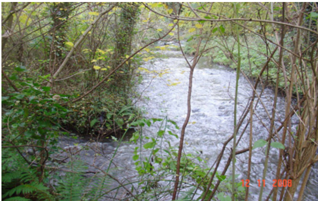
Fig 4.45: Despite a number of problems associated with landuse in Reach 7; there is a reasonable proportion of very good salmonid spawning and nursery habitat and a diversity of riparian vegetation and instream features.