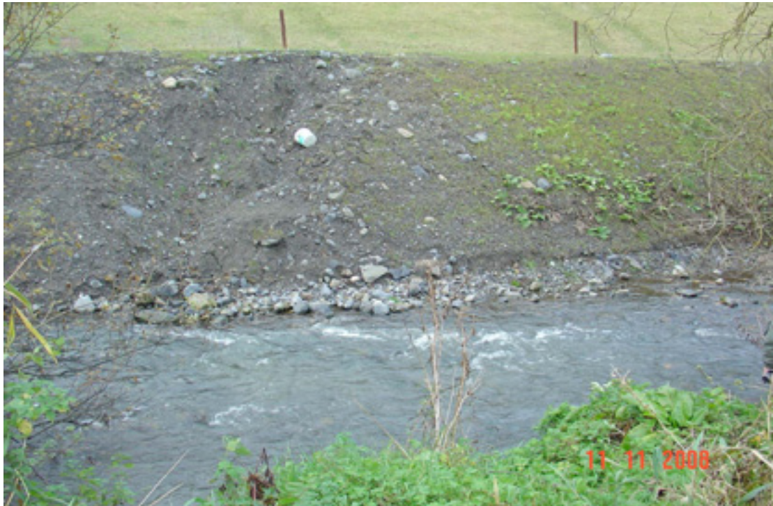
Fig 4.17: There was little or no evidence to suggest that any preventative measures have been taken to reduce silt loading into the river by the operators of the quarry. It is evident from the flood-line in this photo that moderate to large amounts of silt have and will continue to be discharged into the river.

erosion problems. It would be preferable to establish scrub and indigenous woodland on these embankments to provide stability and develop habitat diversity.