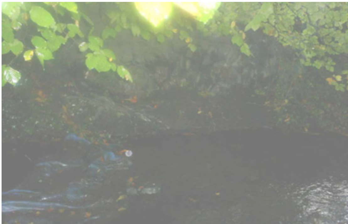
Fig 4.56: This site was heavily shaded and the river flowed over limestone bedrock for the duration of the survey area.

There were no invasive/alien species found on this site