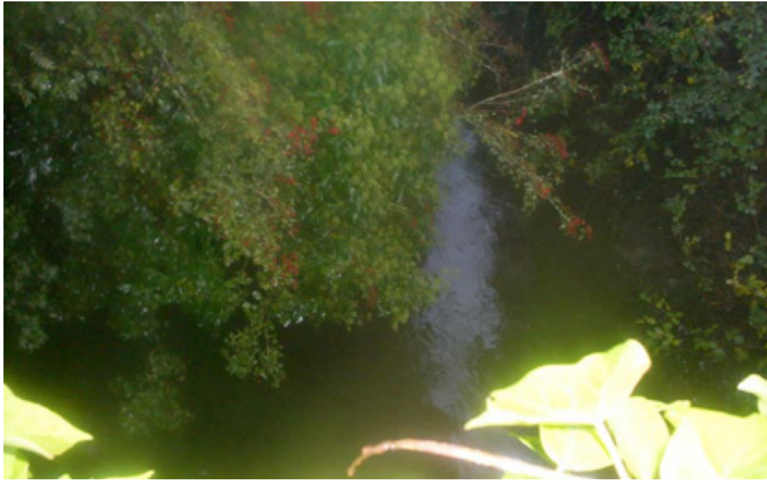
Fig 4.57: The poor picture quality is due to low light levels in the channel. This site was the poorest in respect of habitat quality, excessive modification and is contributing little to the biodiversity of the Delvin catchment.