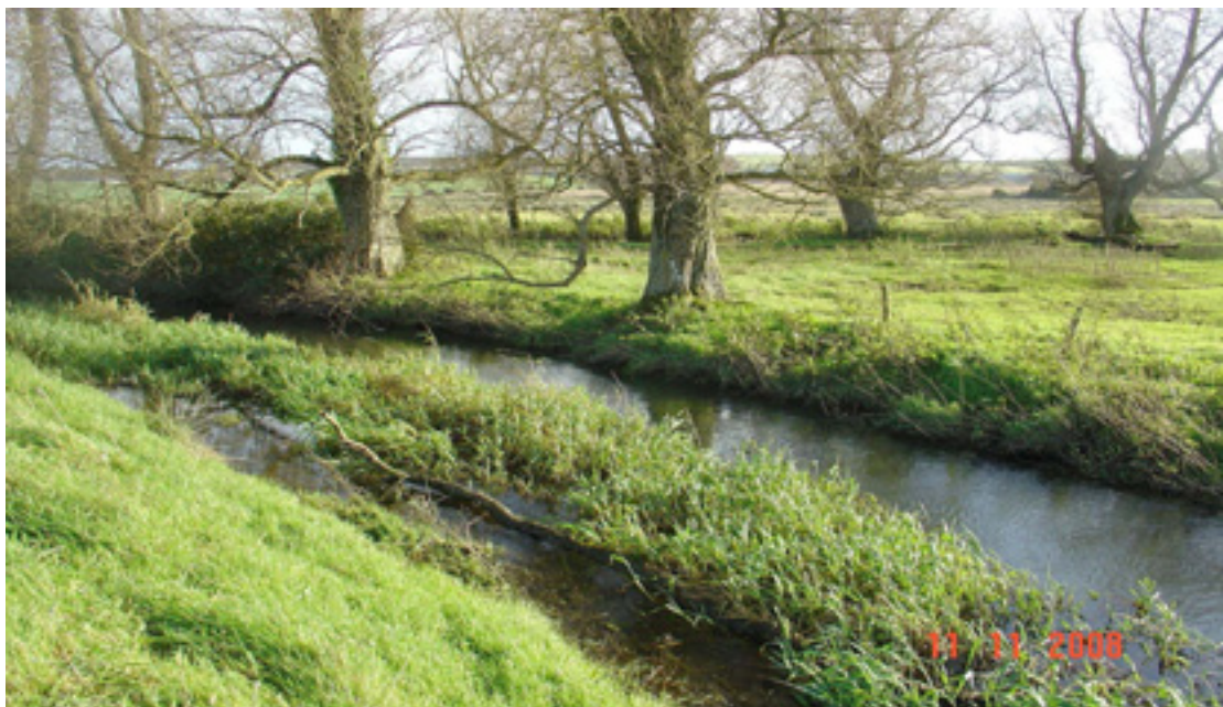
Fig 4.6: Vegetated side bars and deposition. The river channel is reverting back to a base width in which flow is perceptible and instream morphological features are beginning to reform. There were riffled areas in this section and pools developing on bends. A degree of sinuosity was reappearing in the resectioned areas and associated biodiversity was evident.