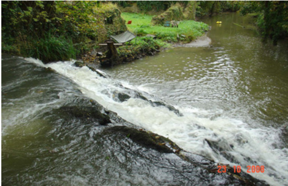
Fig 4.12: The yellow buoys in the picture denote a small-scale water abstraction facility. The falls are occasionally used by locals as a recreational area. It should be noted that access to this area on the LHB is private and the RHB is a council owned sewage facility with illegal access routes that are currently dangerous. There may be possibilities in opening access to the falls and in turn help connect the local community with the river and the issues surrounding its health and biodiversity.