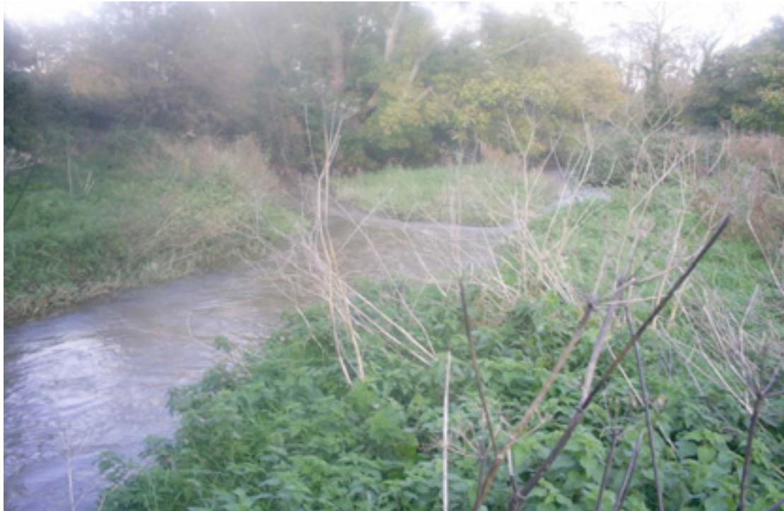
Fig 4.81: Vegetated mid channel bar. There was excellent spawning gravel for salmonids in this section of the site.

Giant Hogweed was present in the survey area