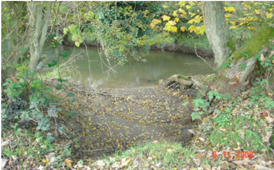
Fig 4.20: Defined pools, natural stream processes of sediment deposition, side and point bars all contribute to a diversity of physical habitats in Reach 5

Reach 5 has undoubtedly the highest ecological value of all the Reaches surveyed and it is vital that the river, the riparian zone and the floodplain are afforded adequate protection. There should be no resectioning, dredging or modification of these areas to facilitate drainage or land reclamation and incentives to farmers and riparian land owners to maintain or even enhance the biodiversity of the river corridor should be investigated and implemented into the biodiversity action plan.