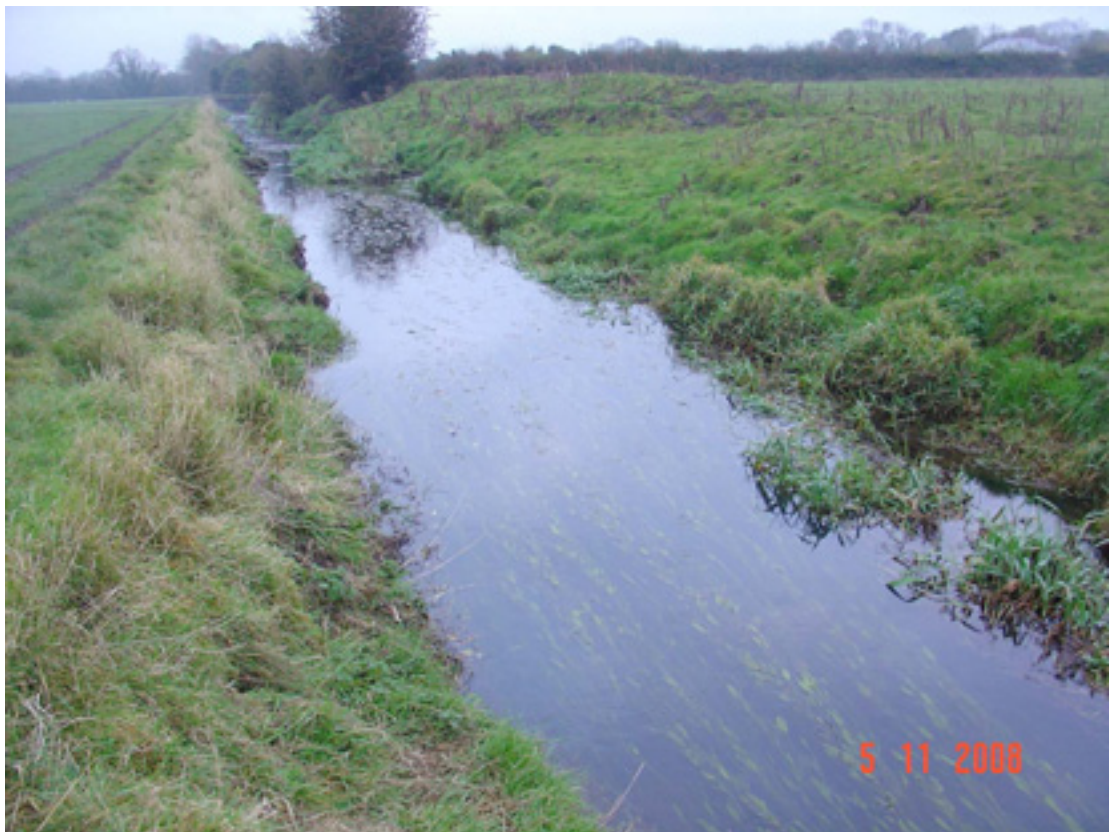
Fig 4.55: The channel substrate in this section is predominantly silt and sand. Silt deposits were up to half a metre deep in some areas.