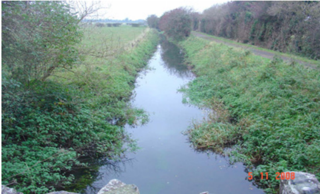
Fig 4.2: A typical stretch of resectioned, dredged and straightened river in Reach 1 at Commons Lower. River flow was generally not perceptible in this section. Instream macrophyte growth was abundant/excessive, and in some areas diverse, though all species were associated with slow/still water, drainage ditches or canals.