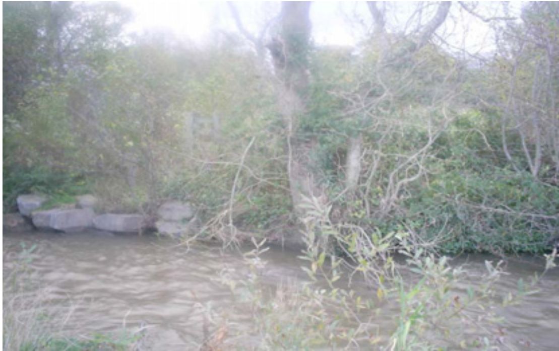
Fig 4.47: The river channel has been periodically modified in Reach 8 though not to the overall detriment of the river as it still maintains a natural riffle-pool-glide configuration with good holding pools and riffles.