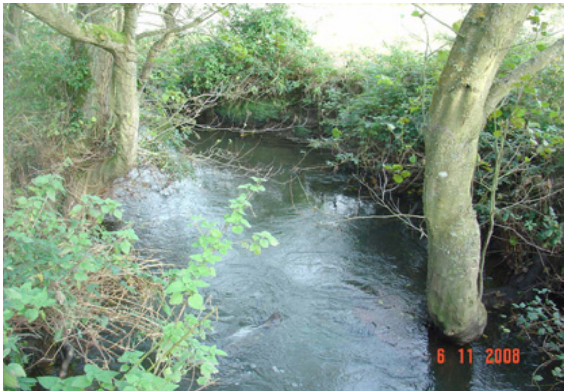
Fig 4.66: A very high quality riverine environment, exhibiting stable banks, and diversity of riparian and instream habitat.

There were no alien/invasive species present on the site.