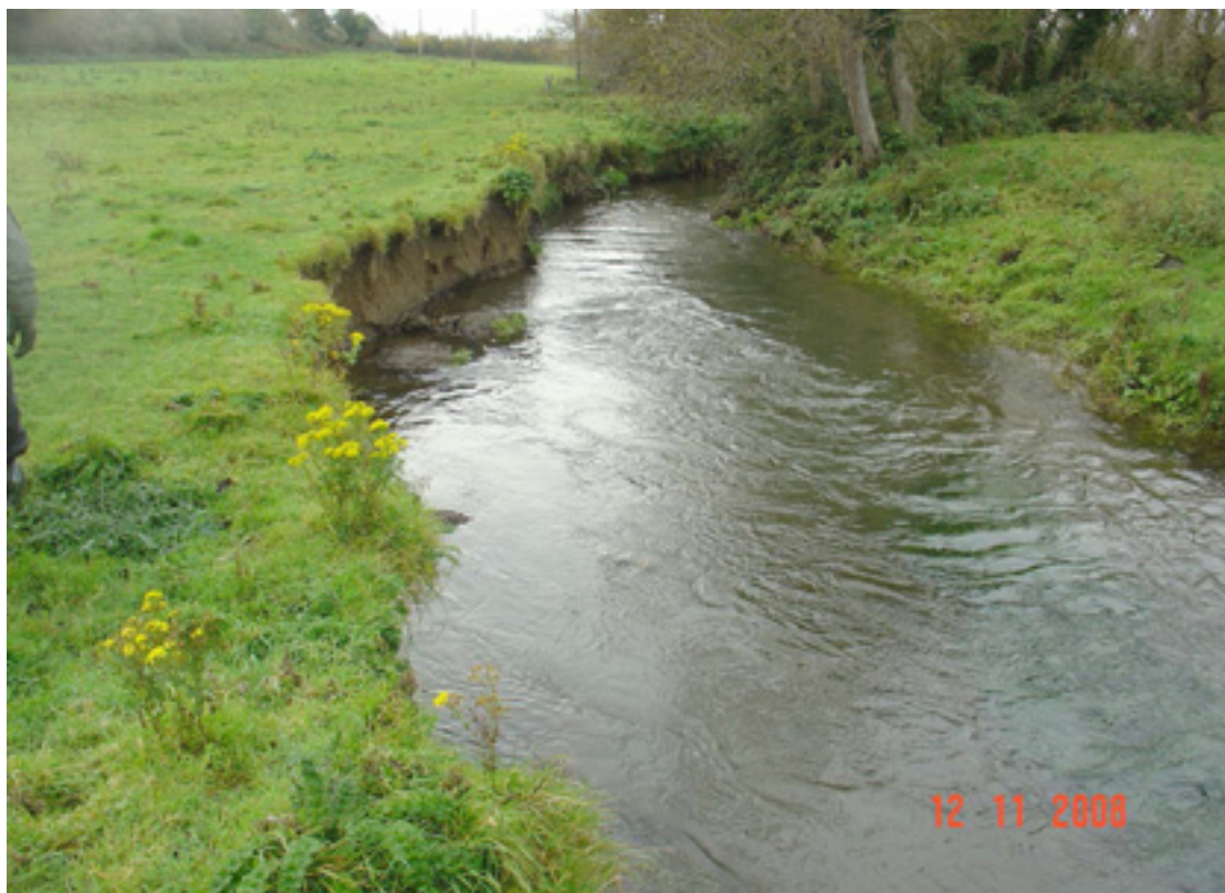
Fig 4.29: The bank erosion at the top end of Reach 7 is primarily caused by the pressure of cattle grazing too close to the bank of the river. The bank throughout this section consists of a sandy loam and will be prone to erosion. Adequate fencing at least two metres from the bank top and bank stabilisation is required.

The lower section of Reach 7 is primarily recreation ground/parkland in the Gormanston demesne. The main problem identified in this section of the Reach is the cutting of grass to the end of the river bank which has impoverished the natural riparian vegetation, reduced biodiversity in the river corridor and had negative impacts on the structural integrity of the river banks.