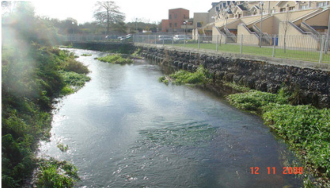
Fig 4.26: This section of the Delvin to the south of the main street in Stamullin has been widened and the LHB reinforced with gabions. Although altered, the river channel has good deposits of cobble and gravel and constitutes good invertebrate habitat and spawning environment for salmonids. There may however be a seasonal problem of low water levels and channel braiding in low summer flows due to the channel widening.