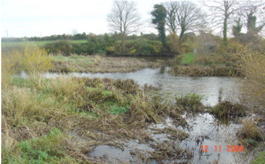
Fig 4.24: Despite the river being realigned/straightened and the partial loss of two oxbow meanders, this section of the Delvin at the rear of a housing estate in Stamullin has a diversity of wetland habitats due to a weir maintaining water height throughout the flooded site. Coots, moorhens and mallard duck were present during the walkover survey.