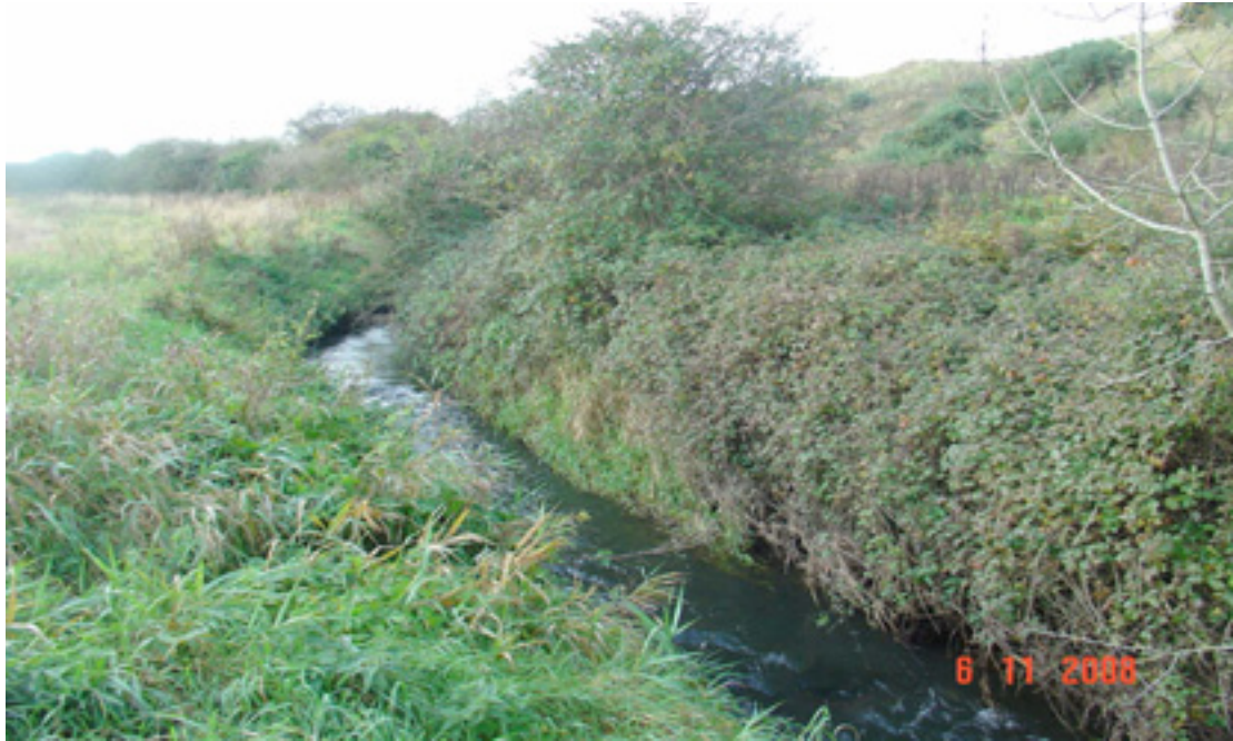
Fig 4.60: Despite its resectioned and embanked nature, this section of river has the capacity to provide food and shelter to a range of aquatic organisms and concerns should be raised in relation to the neighbouring quarry's application to expand operations.