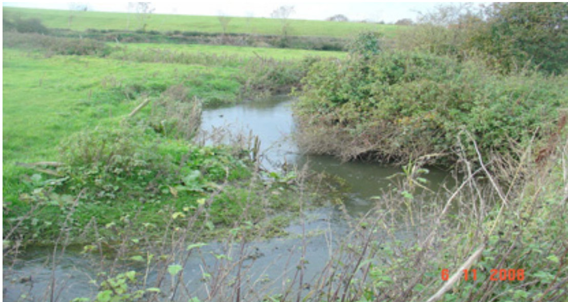
Fig 4.70: This site had a diverse range of riverine morphological habitats among them vegetated point and side bars

Alders were extensive and willow relatively abundant