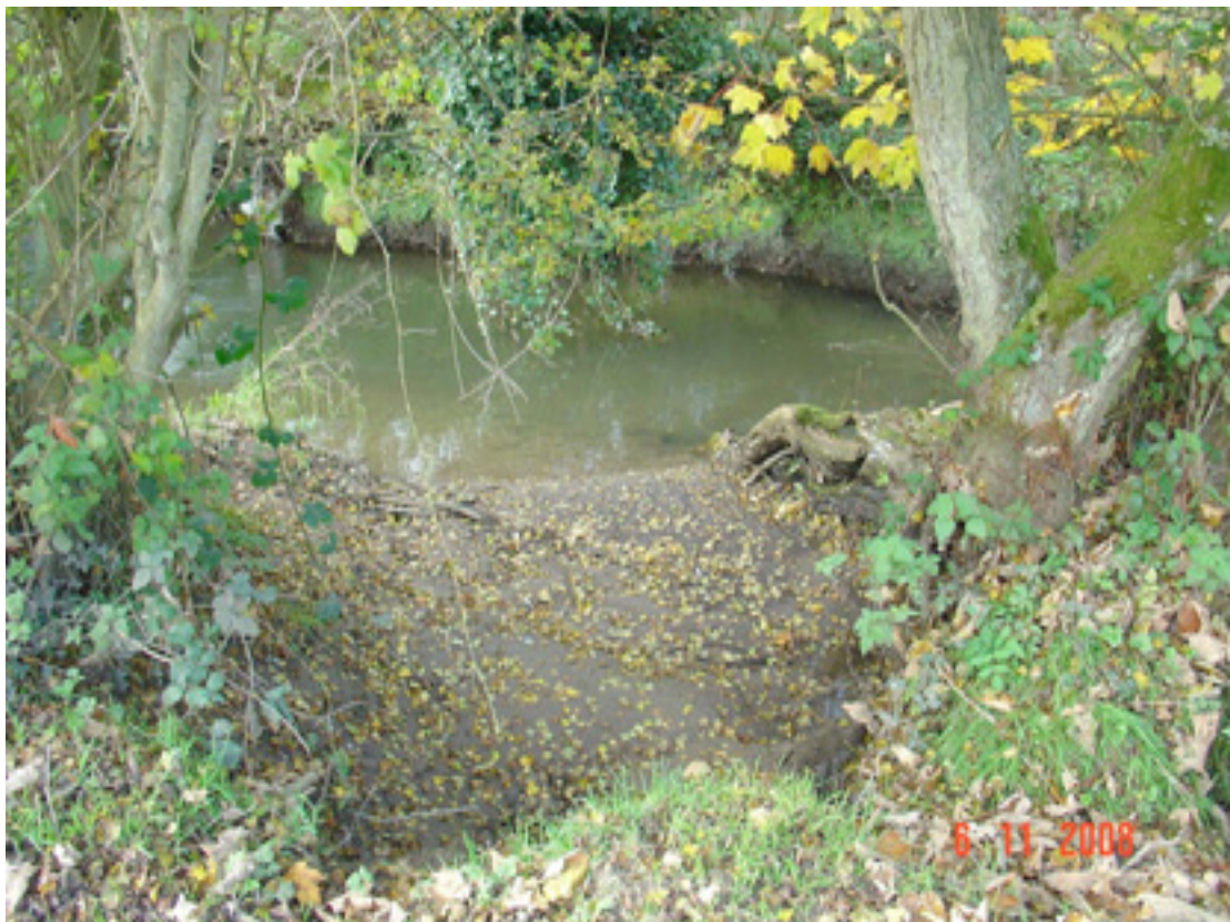
Fig 4.68: Well-established pools and deposition zones were evident throughout the site.