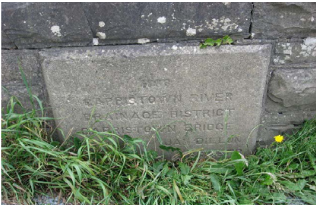
Fig 4.58: This stone at Cockles Bridge commemorates the work of the Garristown drainage district and dates to 1889. This gives an indication of the period of time in which the river has been modified. There is a parliamentary reference from Westminster outlining drainage proposals on the Delvin River in 1880.