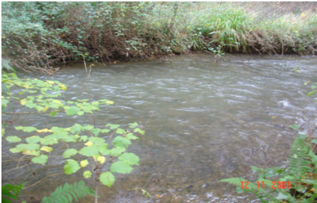
Fig 4.22: Riffles with a diversity of cobbles and gravels are present throughout the Reach and provide an excellent environment for invertebrates, macrophytes and spawning medium for salmonids and other indigenous fish species.