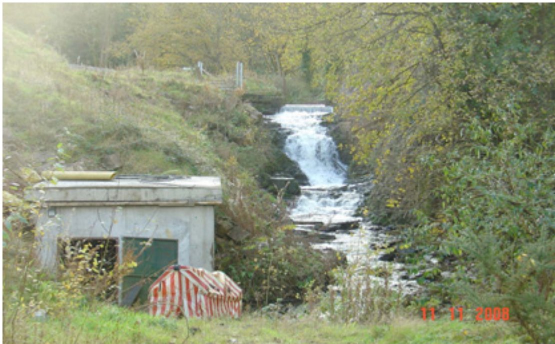
Fig 4.13: The hydroelectric unit below Naul. The river was artificially re-routed and impounded to form a pond upstream and provide sufficient head loss to run a turbine. Although not seriously impacting the river relative to migration (due to the falls immediately upstream) this work will have required planning permission and ministerial consent under the 1959 Fisheries Act. Any such work is potentially devastating to all upstream migration.