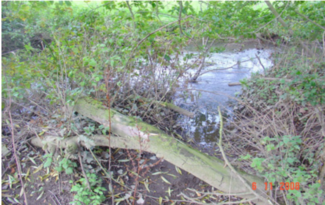
Fig 4.71: Fallen trees and large woody debris were a feature of the site and despite a number of trees in the river channel, bank stability was relatively good.