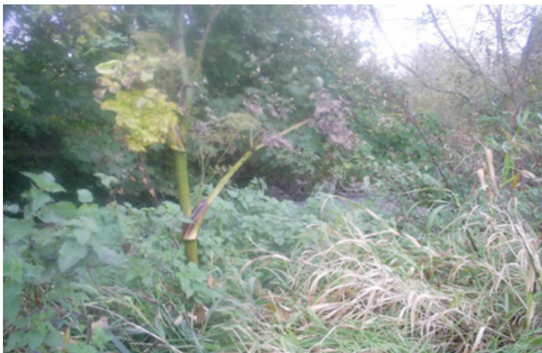
Fig 4.84: Giant Hogweed