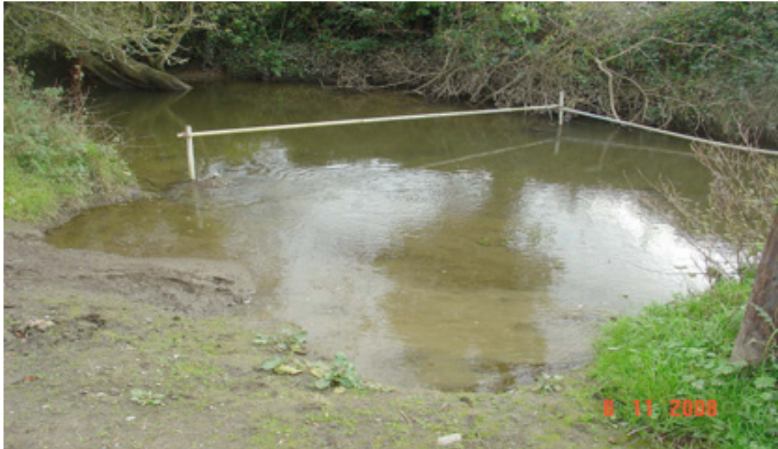
Fig 4.73: A poorly designed cattle drink was responsible for localised siltation and may prove problematic to a spawning area immediately downstream.