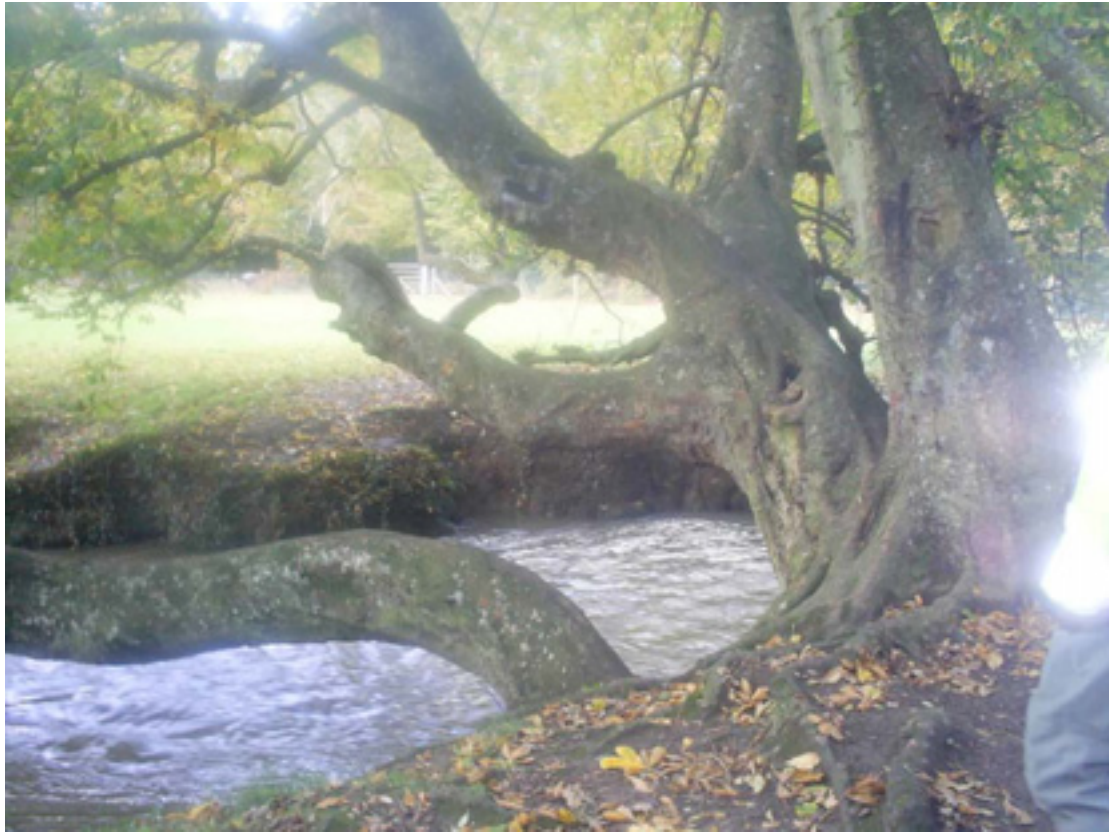
Fig 4.80: The right hand bank of the river for the entire length of the recreation area has evidence of erosion. There is poor riparian and bankside vegetation and issues relating to erosion are only going to increase unless immediate action is taken.