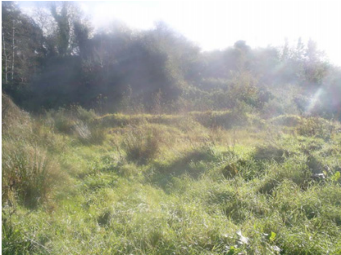
Fig 4.75: There is an extensive flood plain on the left bank at the Stamullin site with wet woodland and associated features. It also plays a vital role in buffering the river from anthropogenic actions.