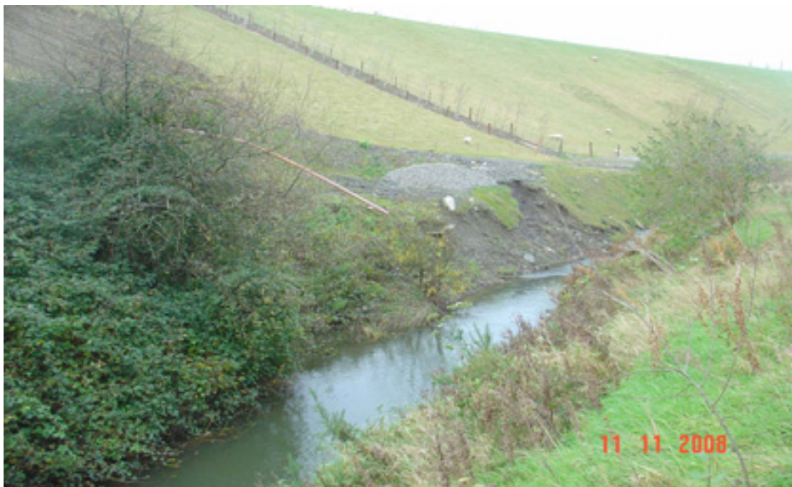
Fig 4.16: Reservations exist as to the stability of these embankments and it would seem irrational to graze sheep on these embankments as they can exacerbate