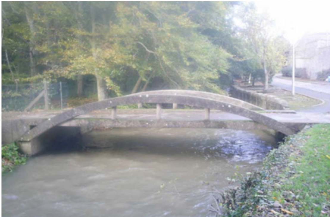
Fig 4.77: Sections of the survey site were modified though would not be considered extensive. This photo shows a reinforced and possibly resectioned area of the river.

Cherry Laurel and sycamore are present on the site.