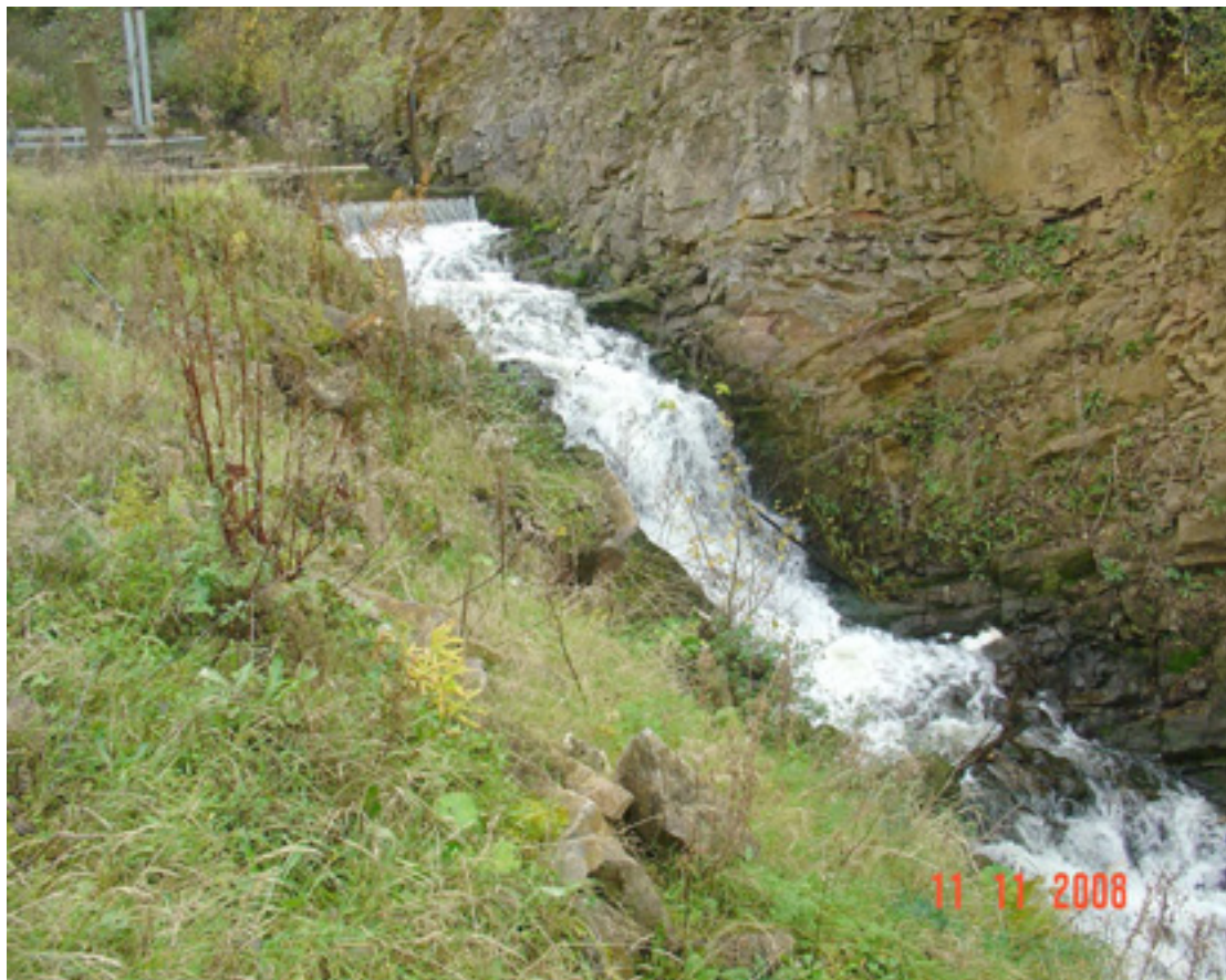
Fig 4.87: The second waterfall NGR 13464 61173

The absence of any hard data on fish species distribution and population estimations does make analysis of the fisheries communities difficult to assess and again it is vital that quantitative and qualitative electrofishing surveys are undertaken at some time in the future.