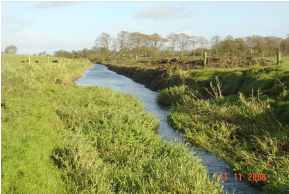
Fig 4.8: This is the middle section of Reach 2 upstream from Bodingtown Bridge. This picture highlights the difference between the regenerating section and a section of the river that was dredged while this survey was being undertaken.