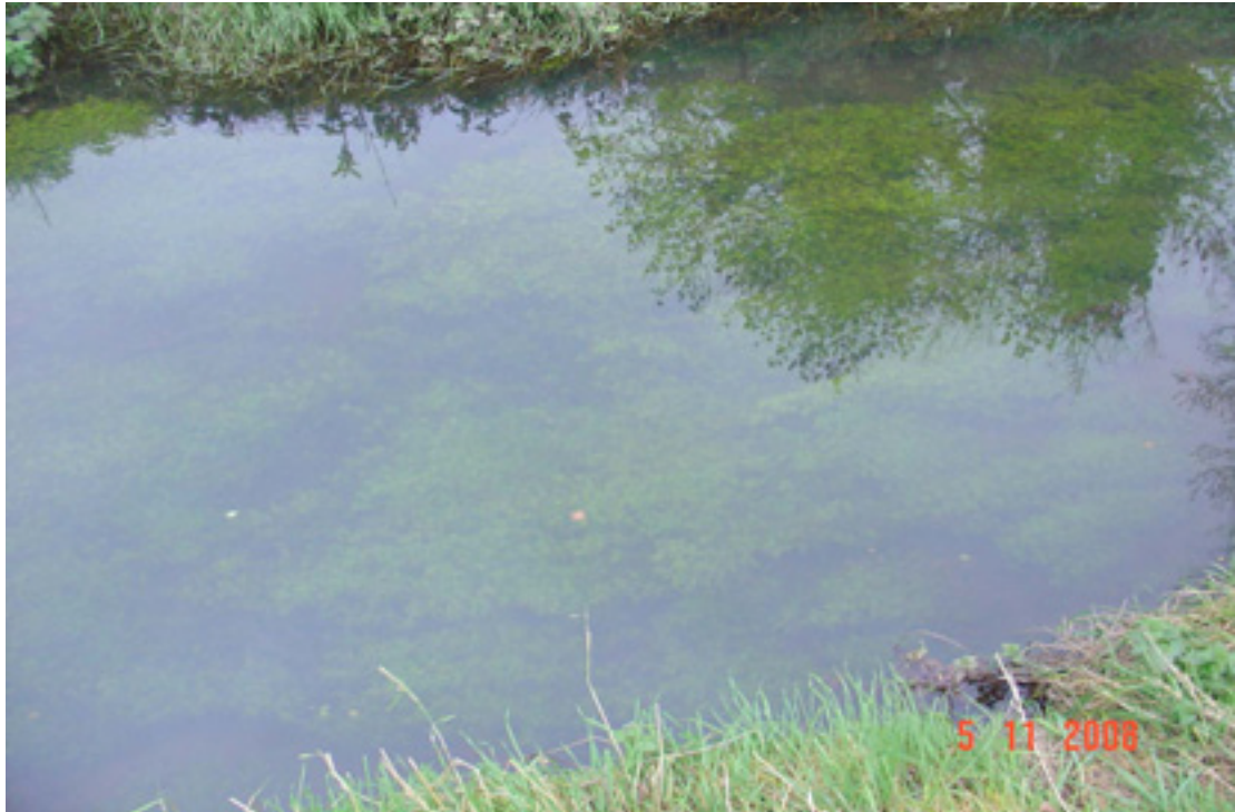
Fig 4.54: Instream macrophyte growth is excessive and many species recorded are associated with slow/still flowing water