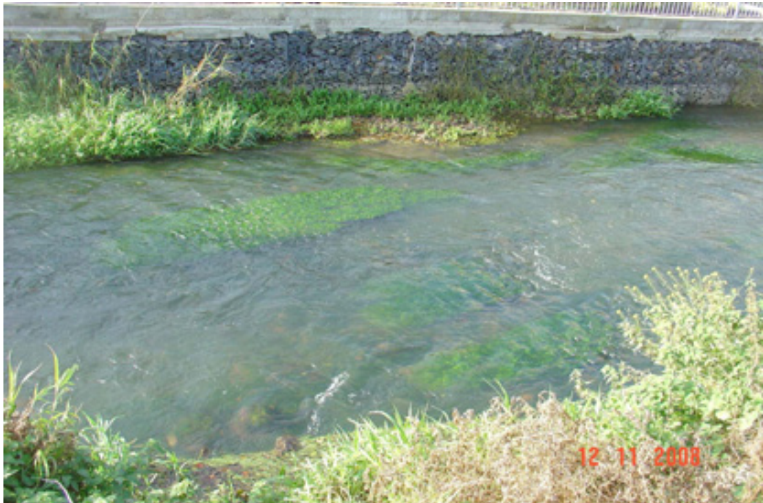
Fig 4.27: The only area of the Delvin River that Water-crowfoot ( Ranunculus penicillatus ) was confirmed present during the walkover survey was in the resectioned area south of Stamullin High Street. Due to poor weather and high water river conditions during the walkover and RHS surveys, it is not possible to comment accurately on the distribution of Water-crowfoot within the Delvin catchment.