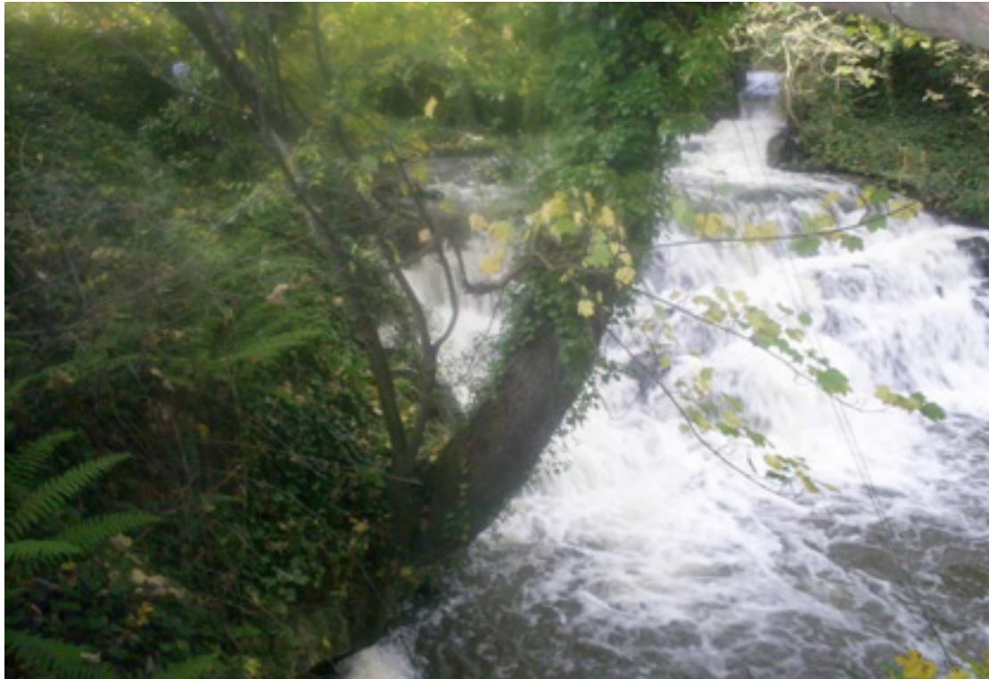
Fig 4.63: The waterfall at Naul is >5m in height and presents a total block to all upstream migration of fish and aquatic invertebrates. There is also however, a man-made water fall 400m d/s which is similarly prohibitive to all upstream migration.