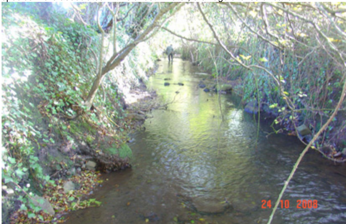
Fig 4.3: A heavily shaded section of Reach 1 below Cockles Bridge. There were no instream macrophytes in this section and the bed of the river consisted primarily of cut and channelled bedrock. At a local habitat scale, substratum and current velocity are probably the most important factors determining the type of macroinvertebrate taxa present. The stream substratum has obvious importance because the vast majority of stream micro-invertebrates spend most of their lives attached to substrata. The particle size of inorganic matter has a large influence on macroinvertebrate community structure and this bedrock environment presents a very poor environment for both macro and micro invertebrates.