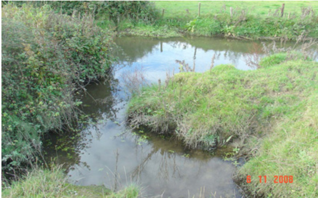
Fig 4.67: Protected backwaters and inlets enhance diversification. There were a number of such features on this site.