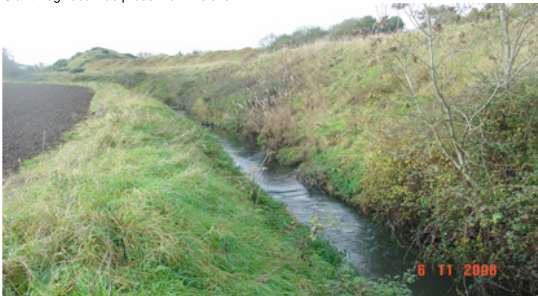
Fig 4.59: The river is obviously resectioned and embankments separate the river from the flood plain. The base width of the channel is 2.3m and in conjunction with a reasonable gradient, the water maintains depth and velocity.