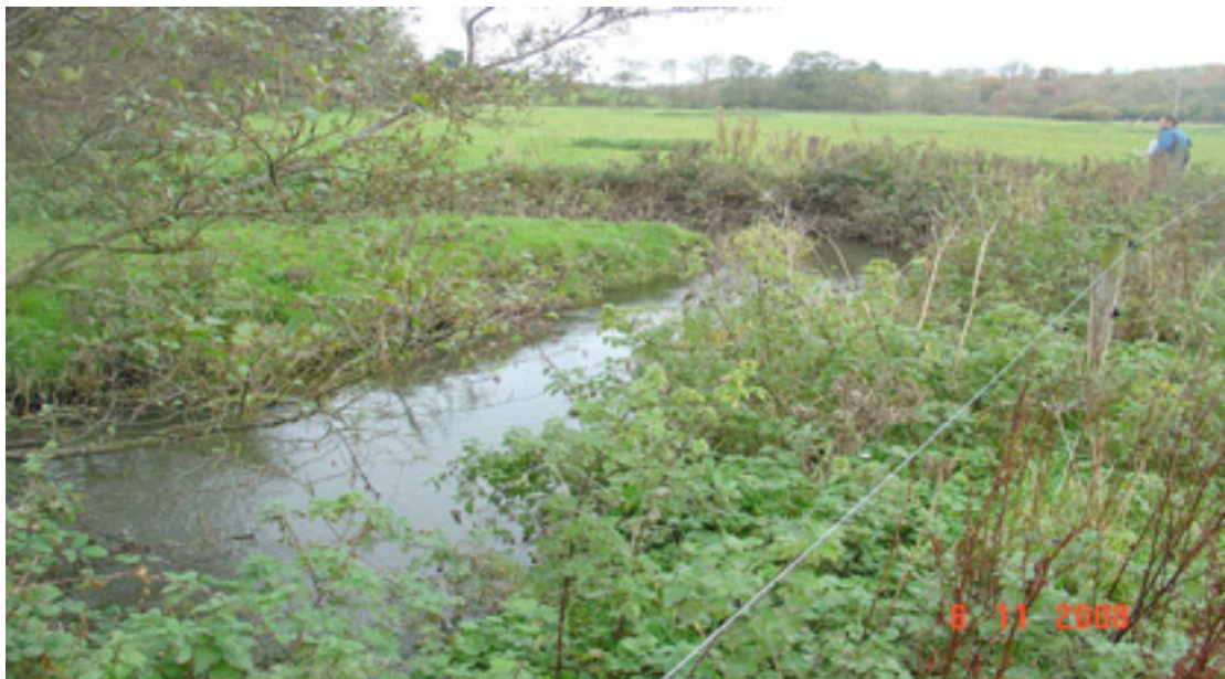
Fig 4.72: Excellent channel sinuosity was a feature of this site with good riffle-pool-glide configuration.