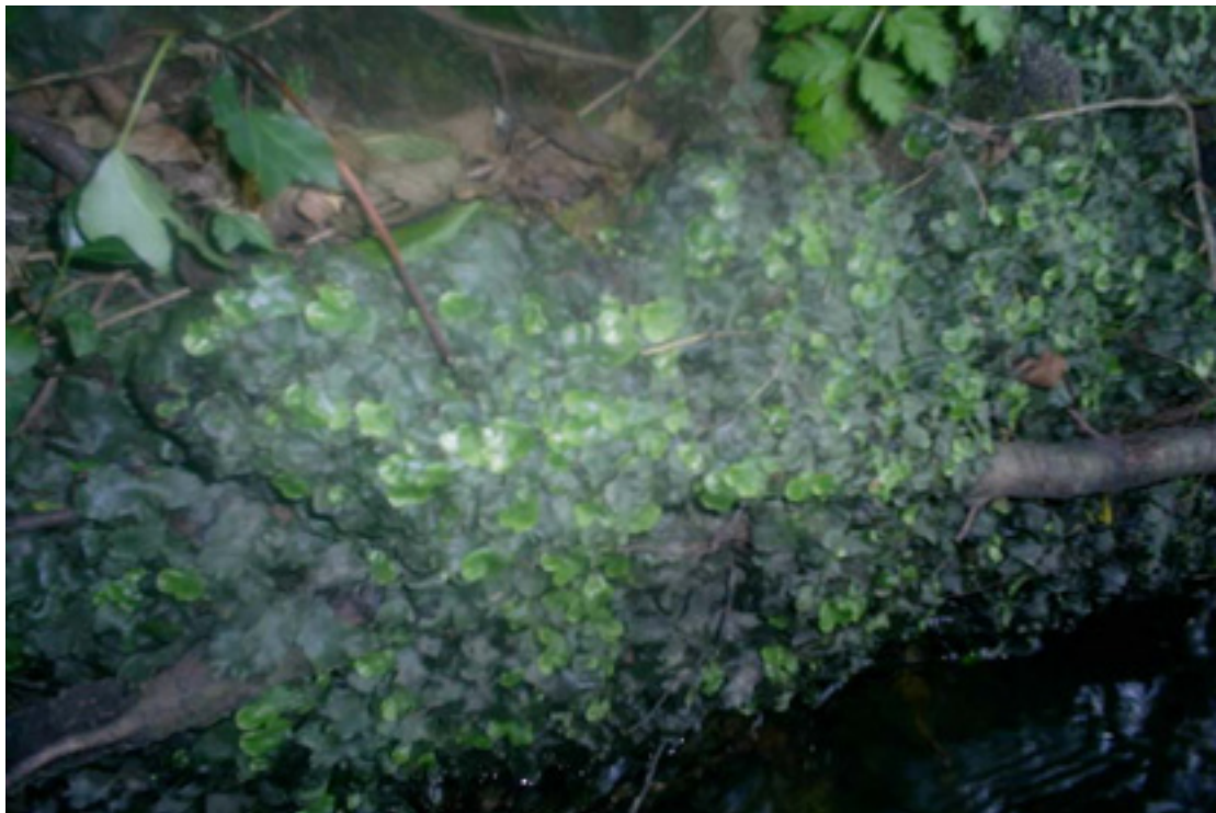
Fig 4.76: Anthoceros laevis , a liverwort found on much of the surface area of the clay banks at this site.