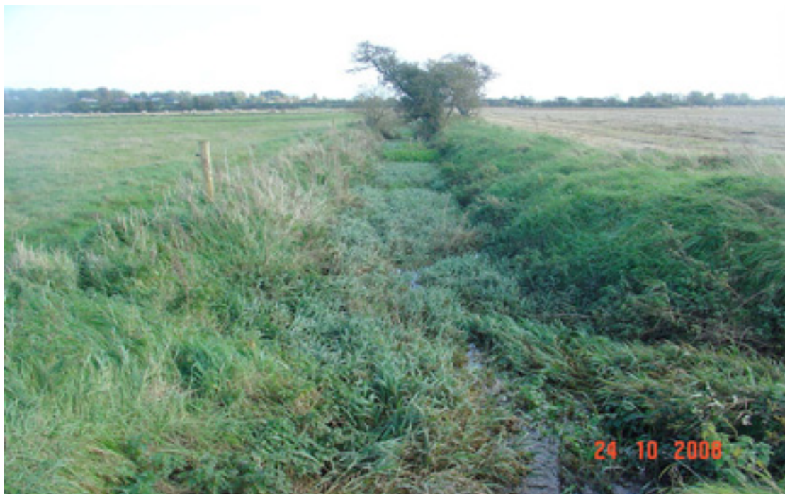
Fig 4.1 : This section of the Delvin river channel is approximately 500m d/s from RHS site 1. This is the beginning of the highly modified (Reach 1) that runs from near the source to the end of Reach 1 at Glebe East. The channel is choked with Reed Canary Grass ( Phalaris arundinacea ) and at least three kilometres of channel have at best the occasional tree or none.

A final notable feature of Reach 1 is the heavily vegetated bedrock channel that has been cut from Cockles Bridge for approximately 700m downstream into the townland of Glebe East. The river is heavily modified in this section and in conjunction with excessive shading and bedrock substrate; there is little of note in respect of river-based biodiversity. The trees will provide shelter, food and nesting areas for birds and though light is an essential prerequisite for life in rivers it is not deemed a priority to reduce the canopy cover due to the bedrock substrate.