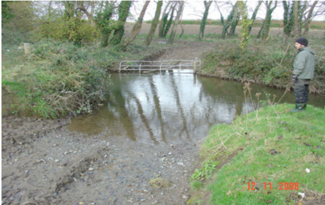
Fig 4.32: The ford is poorly constructed and releasing silt and suspended solids during use and high flows in the river. Livestock have unmanaged access to the river and erosion problems will be further exacerbated unless this area is properly fenced and managed.