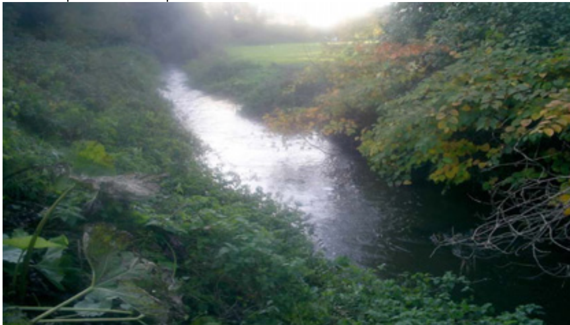
Fig 4.62: The top section of the site, the river bank on the right side has been embanked using tipped material from a recent development. The embankment is over 5m high and steep sided.

Japanese knot weed was present on the left hand bank above the bridge in Naul. Cherry laurel and privet were also present.