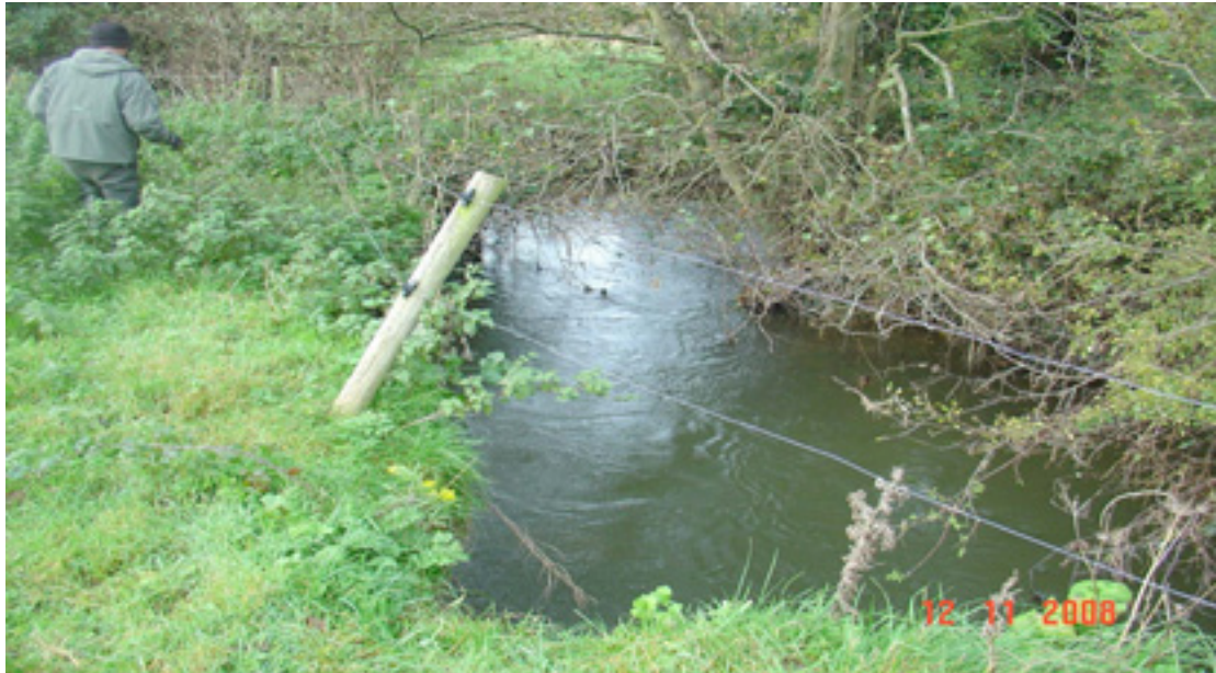
Fig 4.30: Fencing was erected too close to the river bank and did not adequately limit the areas grazed by livestock to permit the long term establishment of riparian and bankside vegetation. The bank collapse, the destruction of the fence and the subsequent loss of land and money for the fencing are the result of 'cutting corners'.