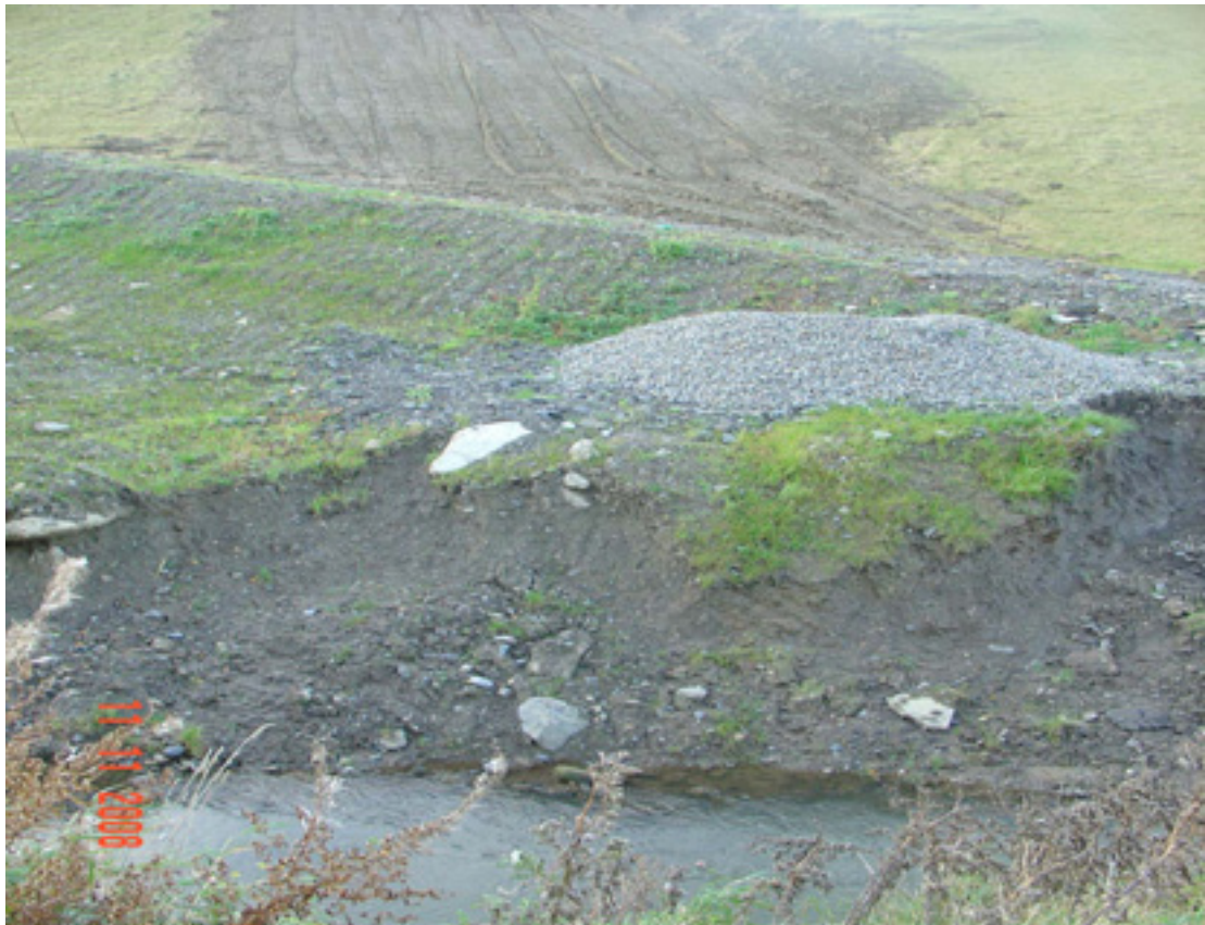
Fig 4.15: In this picture, there are a number of major issues impacting the river and the surrounding riparian habitat. The main bank at the top of the picture is unstable and has recently had a major landslide which has been patched up. Below this, tipped stone, quarry infill and the bank have eroded and deposited materials into the river.