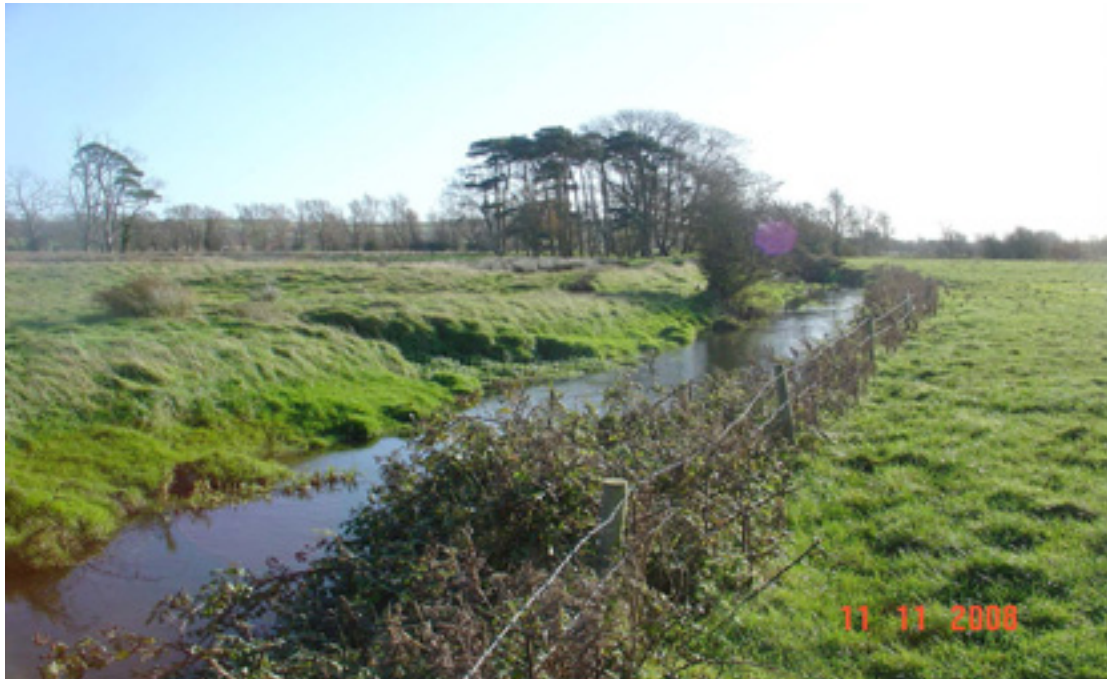
Fig 4.4: The beginning of Reach 2; it was immediately apparent that the river corridor was undergoing positive changes. This change is directly attributable to no major river maintenance in respect of dredging or resectioning being undertaken. However, it is difficult to assess how long this regeneration process has been in operation, and

It is evident that in recent years, no major river maintenance work has been undertaken on the majority of Reach 2 and as a result the river's natural morphological processes are resulting in a semi-recovery from its degraded state. In its attempts to attain a regained equilibrium the canalised river may erode and deposit sediment from its bed and banks thus creating a meandering or braided course. There is sufficient space in the resectioned channel for these processes to occur without negatively impacting the landowner's property. The process can be assisted by removing redundant bank revetment and by reducing the frequency or cessation of maintenance operations. All that may be needed is to monitor whether lateral migration is causing problems in respect of prejudicing drainage or flood defence requirements.