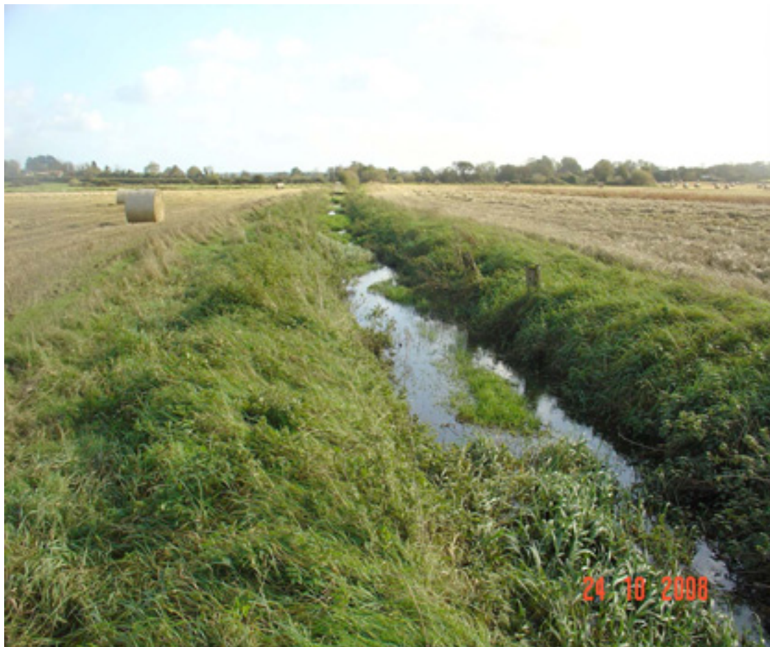
Fig 4.86: This section of the Delvin River upstream of Garristown Bridge exhibits many indicators of poor riverine habitat. This represents very poor habitat for most indigenous fish species and it would be financially prohibitive to undertake remedial action in this section. It would benefit from fencing and planting of willow slips in the medium to long term.

It is unlikely that salmonids would be able to survive in many reaches of the upper Delvin. There is insufficient gravel for spawning in the main channel and it is apparent that piecemeal drainage actions have been undertaken on most of the smaller tributaries entering the river. Large sections of the upper catchment have excessive macrophyte growth and in summer, reduced flow and elevated water temperatures in conjunction with the oxygen demand of the instream macrophytes at night would create very difficult conditions for salmonids to survive.