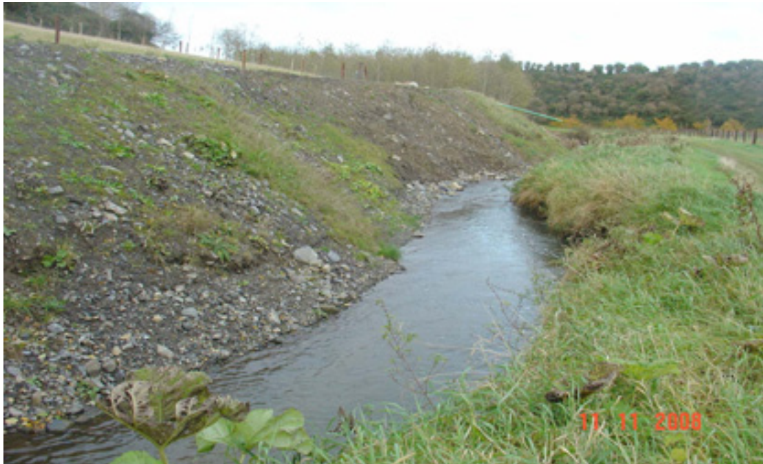
Fig 4.19: The gradient of the embankment is too steep and no provision has been made for a two-stage channel or buffer zone between the tipped material and the stream. No topsoil has been put on the embankment to promote re-vegetation and subsoil is constantly eroding and entering the river. The structural integrity of this entire structure is vulnerable and it is envisaged that large sections of this embankment will break off and enter the river.

particularly unstable and mitigation will require re-profiling, bank stabilisation and revetment.