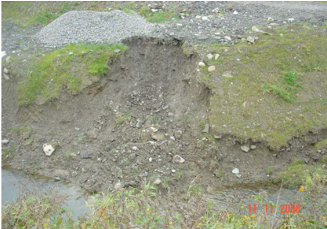
Fig 4.18: It is evident from this picture that large amounts of silt and tipped building material has already been washed into the river. Again, there is no visible evidence of any remedial work to tackle erosion or prevent silt entering the river. This bank is