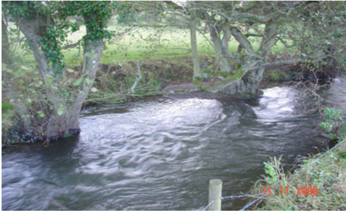
Fig 4.23: Stable banks in combination with an unmodified channel and established vegetation provide the essential elements of good riverine habitat but the physical qualities of the river cannot compensate for poor water quality and there are serious concerns in relation to water quality data and associated biological indicator species.