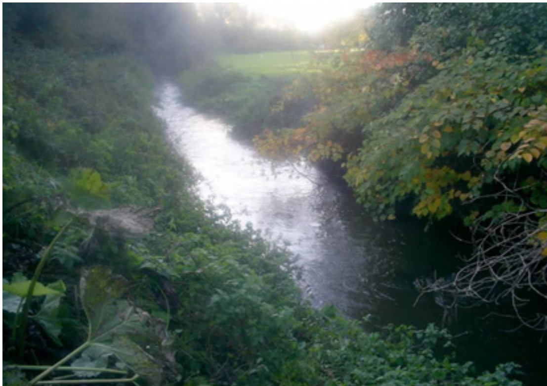
Fig 4.10: The end of Reach 2 at Naul, despite obvious resectioning of the river bank, there is a diversity of instream and riparian habitat as the river approaches Naul. There are, however, overall negative factors relating to water quality in this reach and serious concerns that the instream biota has been severely impacted with possible elimination of fish and invertebrate species on a localised level.