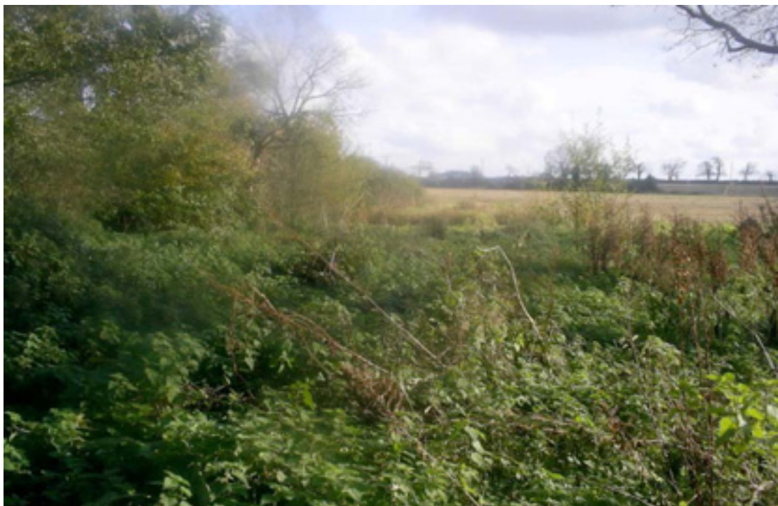
Fig 4.83: Landuse was predominantly tilled land on the right hand bank with a reasonable buffer zone of tall herb and rank vegetation and scrub and shrubs. The left bank was dominated by broadleaved mixed plantation and parkland.