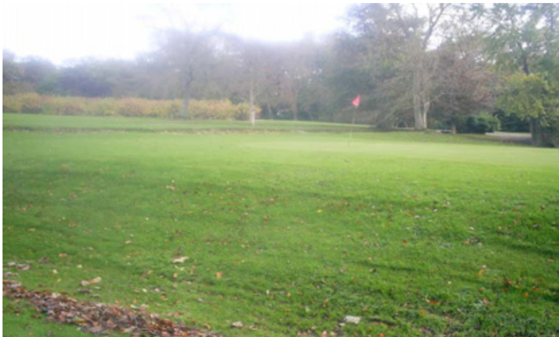
Fig 4.33: Recreation, parkland and gardens are the predominant features of the Gormanston Demesne. The practice of mowing to the top of the river bank should be prohibited and a minimum of a three metre buffer zone from the edge of the river bank should be left uncut where possible. There could be an interesting study for students at Gormanston to study re-colonisation and assist in planting willow and alder to promote riverbank stability.