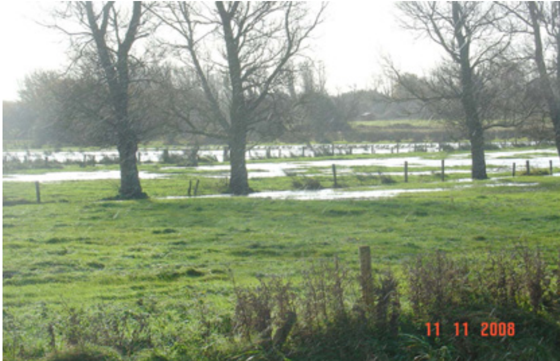
Fig 4.7: The floodplain is active. During the walkover, large flocks of Curlew, Widgeon and Teal were present. Snipe were also seen. The water in the fields in view appeared to be at the same level as the river level and attempts had been made to try and drain this ground. It would require a major drainage operation to alleviate flooding in these fields and would have catastrophic consequences for upper reaches of the Delvin River.